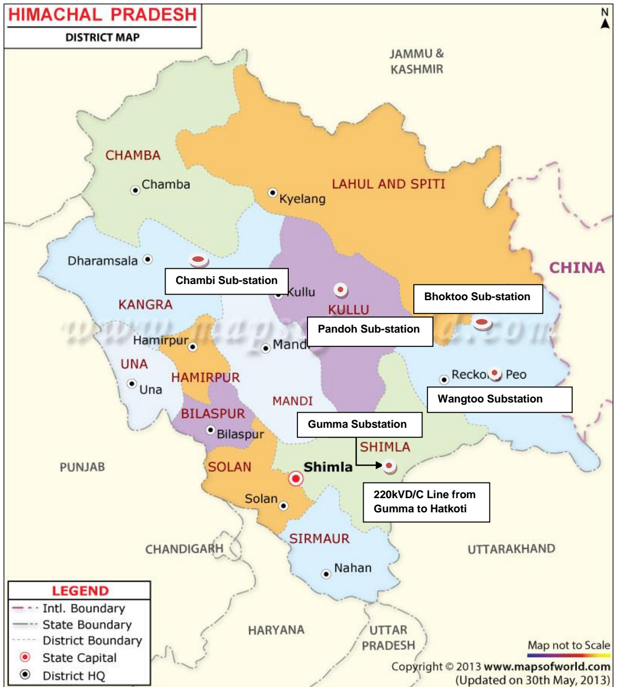
Figure 1 Index Map