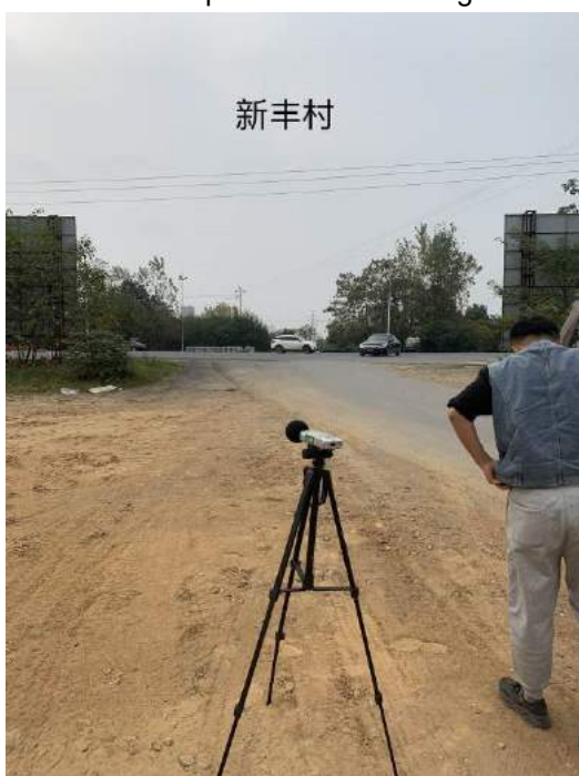
N3 Xinfeng Village