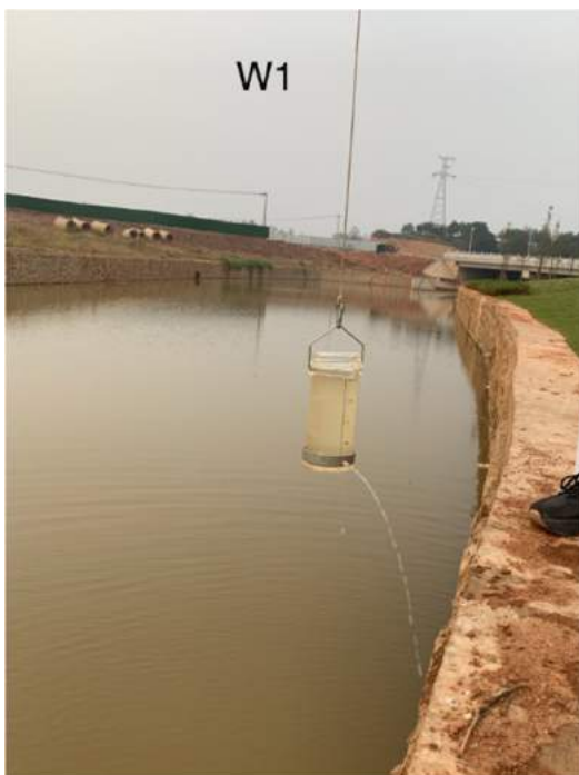
50m above water body SW1