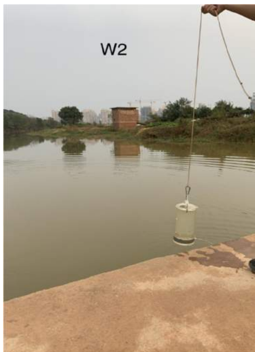
100m downstream of the water body SW2