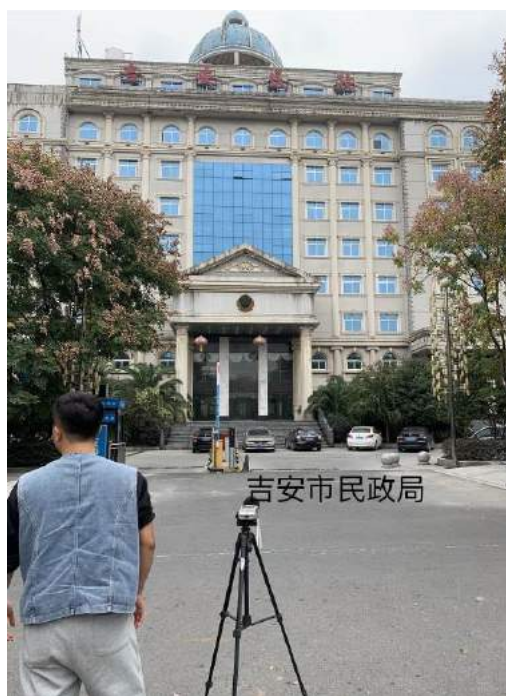
N12 Ji'an Civil Affairs Bureau