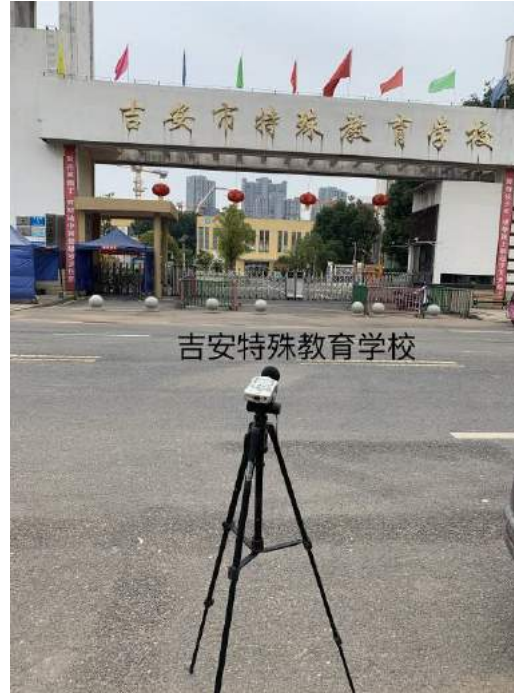
Ji'an Special Education School N5