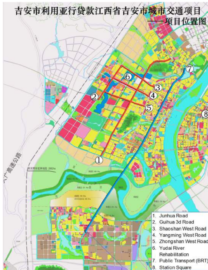
Picture: Project location

26. According to the construction conditions of various roads, the monitoring contents include the surface water quality monitoring of the Yudai River crossing the water body (Shaoshan West Road and Boyan Avenue), and the air quality environmental monitoring of sensitive points during the construction period (Junhua Avenue, Yangming West Road, Zhongshan West Road, Shaoshan West Road and Boyan Avenue), noise monitoring of sensitive points during the construction period (Junhua Avenue, Yangming West Road, Zhongshan West Road, Shaoshan West Road, Boyan Avenue and BRT Road). The samples of water, air, soil, etc. were collected and sent to the lab test. The samples were analyzed and tested in time, and noise was monitored on site.