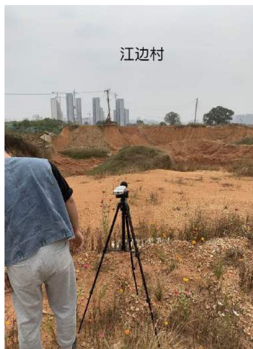
Jiangbian village N2