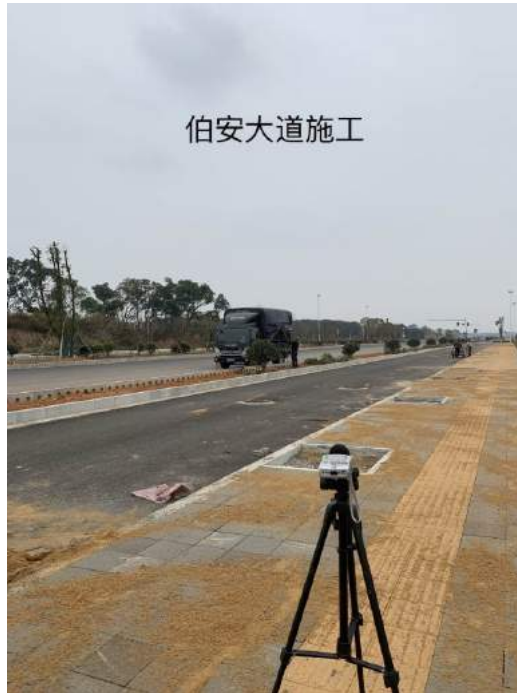
Bo'an Road construction pointN7