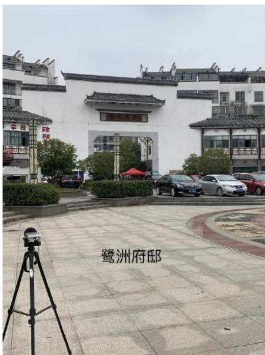
N13 Luzhou Mansion