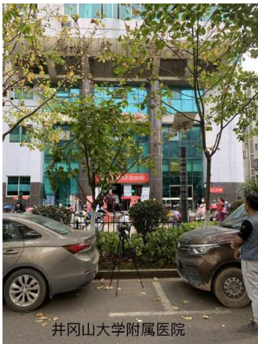
N9 Jinggangshan University Affiliated Hospital