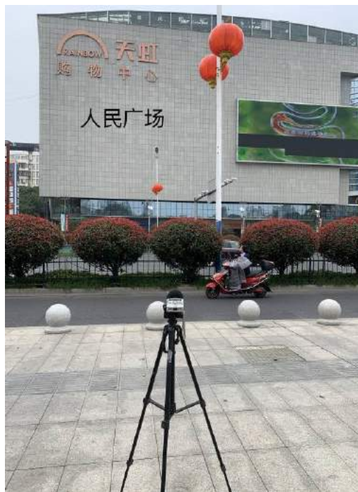
N10 People Square