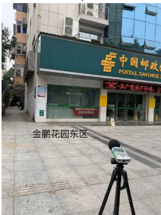
N11 Jinpeng Garden East