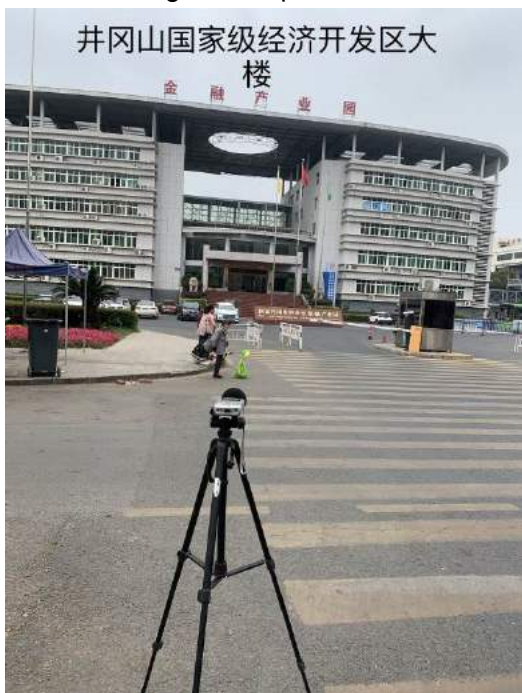
N1 Jinggangshan National Economic Development Zone Building

Monitoring item: equivalent continuous A sound level.