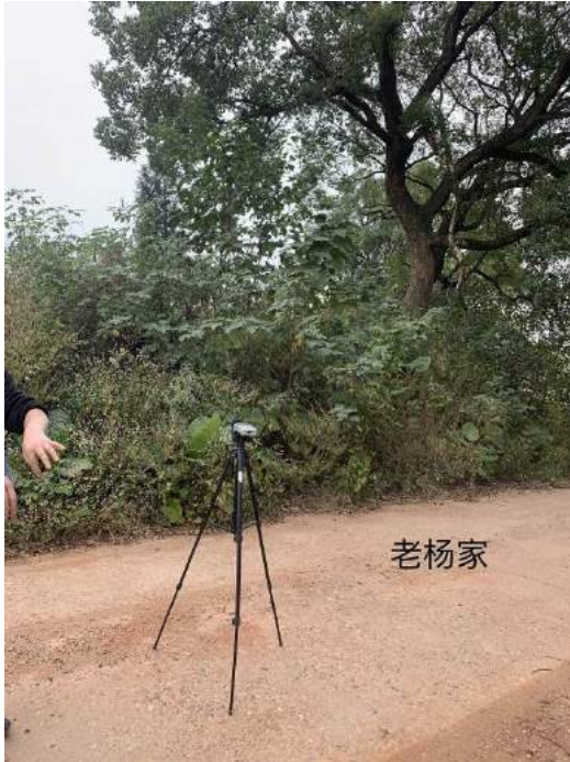
Laoyangjia Village N1