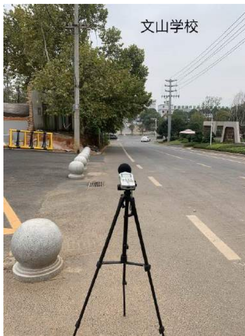
N2 Wenshan School