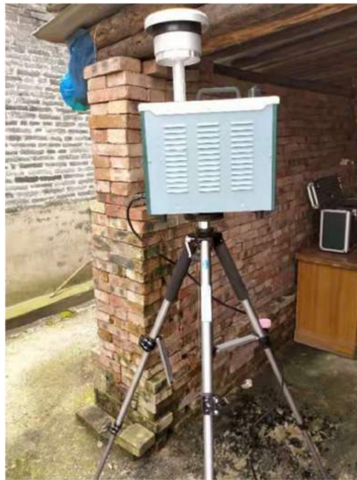
A1 Shili Village