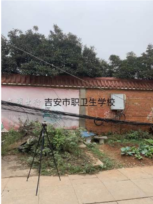
Ji'an Occupational Health School N4