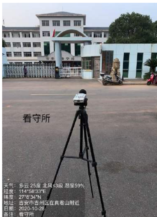
Detention center N9