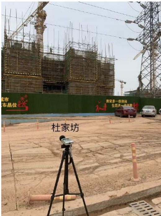
Dujia fang Village N6