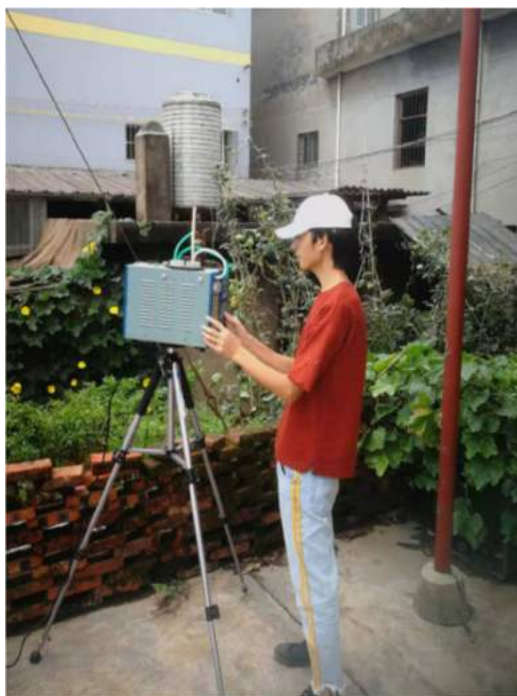
A1 Nan'an Village