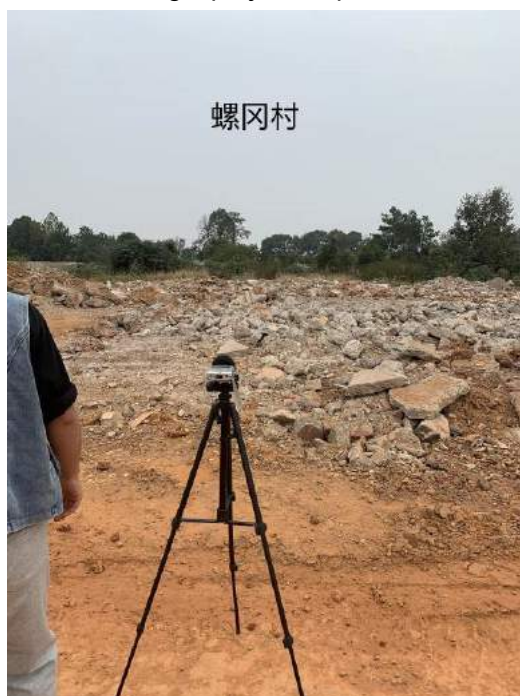
Luogang Village N1

Monitoring project: Equivalent continuous A sound level.