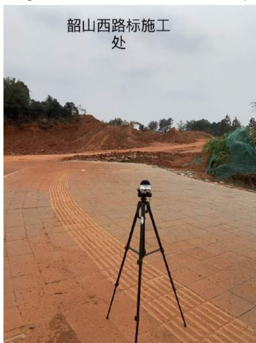
Shaoshan West Road construction pointN3