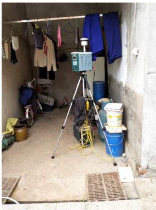
A1 Cunqian Village