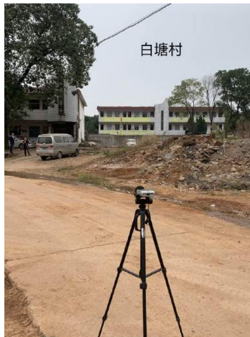
Baitang Village N3