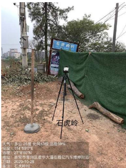
Shihuling Village N8