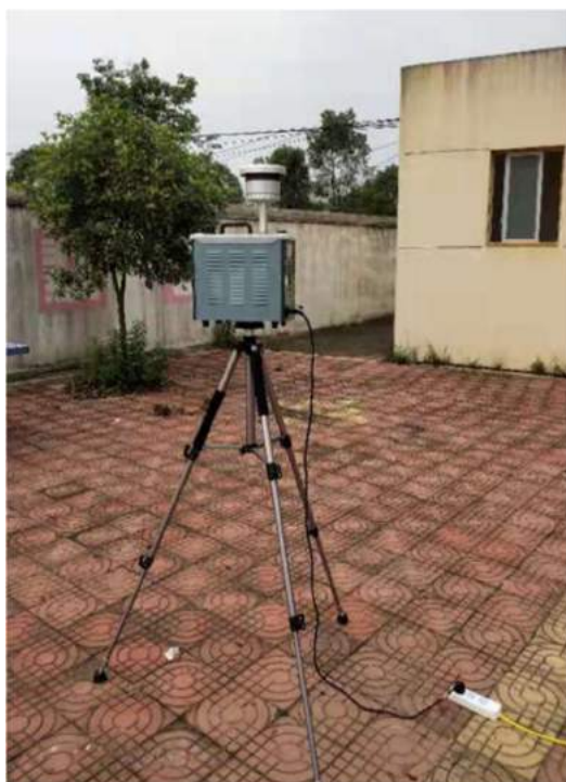
Jiangbian Village A1