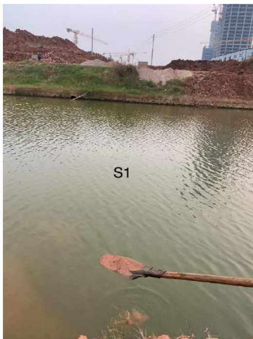
Dredging point of Yudai River

Monitoring items: pH, zinc, chromium, arsenic, cadmium, chromium (hexavalent), copper, lead, mercury, nickel, carbon tetrachloride, chloroform, methyl chloride, 1,1-dichloroethane, 1,2-dichloroethyl Alkane, 1,1-dichloroethylene, cis-1,2-dichloroethylene, trans-1,2-dichloroethylene, dichloromethane, 1,2-dichloropropane, 1,1,1,2-Tetrachloroethane, 1,1,2,2-tetrachloroethane, tetrachloroethylene, 1,1,1-trichloroethane, 1,1,2-trichloroethane, trichloroethylene, 1, 2,3-trichloropropane, vinyl chloride, benzene, chlorobenzene, 1,2-dichlorobenzene, 1,4-dichlorobenzene, ethylbenzene, styrene, toluene, m-xylene + p-xylene, o-xylene Toluene, nitrobenzene, aniline, 2-chlorophenol, benzo [a] anthracene, benzo [a] pyrene, benzo [b] fluoranthene, benzo [k] fluoranthene, pyrene, dibenzo [a , h] anthracene, indeno [1,2,3-cd] fluorene, naphthalene.