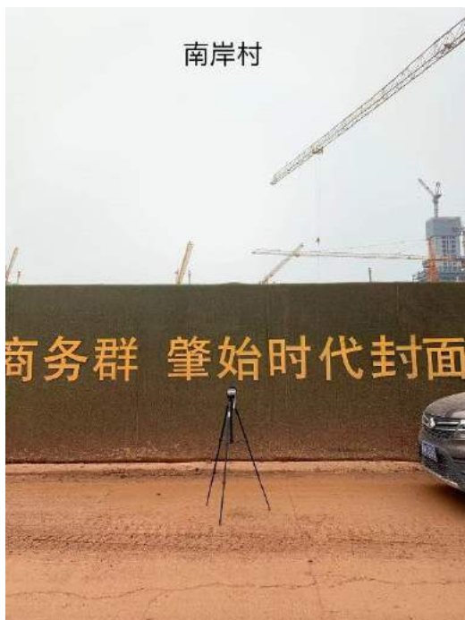
Nan'an Village N1

Monitoring project: Equivalent continuous A sound level.