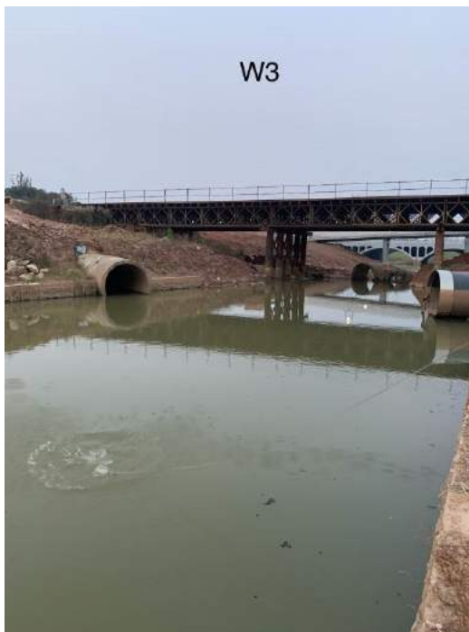
50m above water body SW1

Monitoring parameter : pH value、Suspended matter、COD、Ammonia nitrogen、Petro、Fecal coliforms