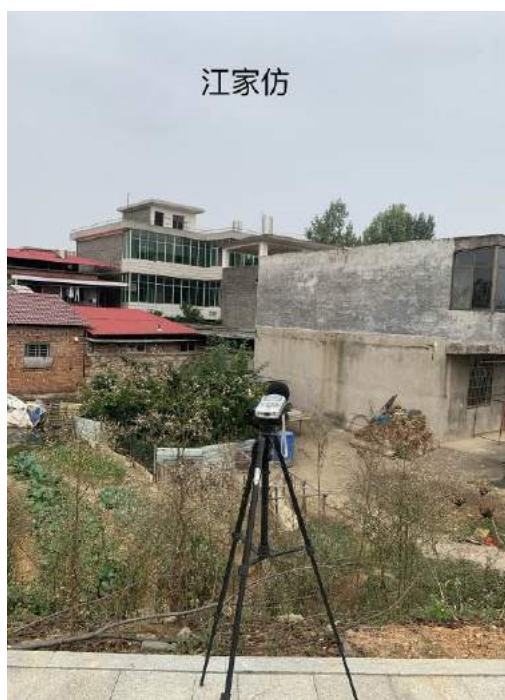
N4 Jiangjiafang Village