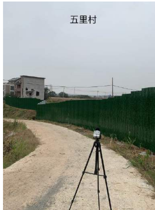
Wuli Village N7