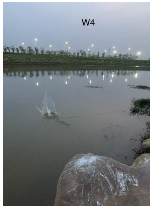
100m downstream of the water body SW2