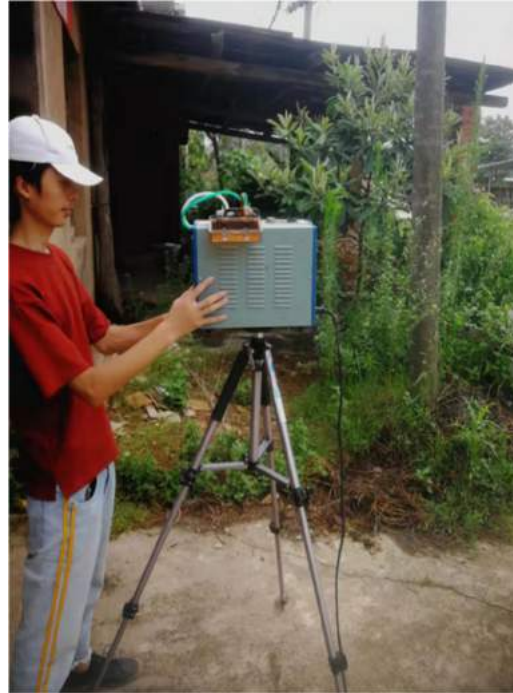
Detention center A2