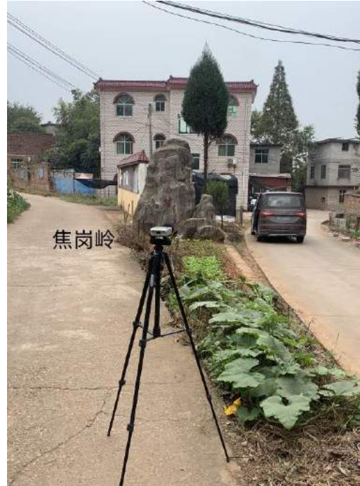
Jiaogangling Village N2