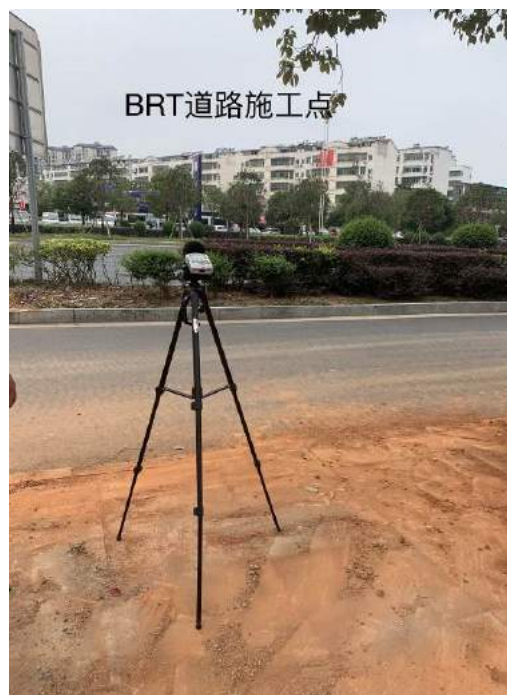
,N14 construction site.