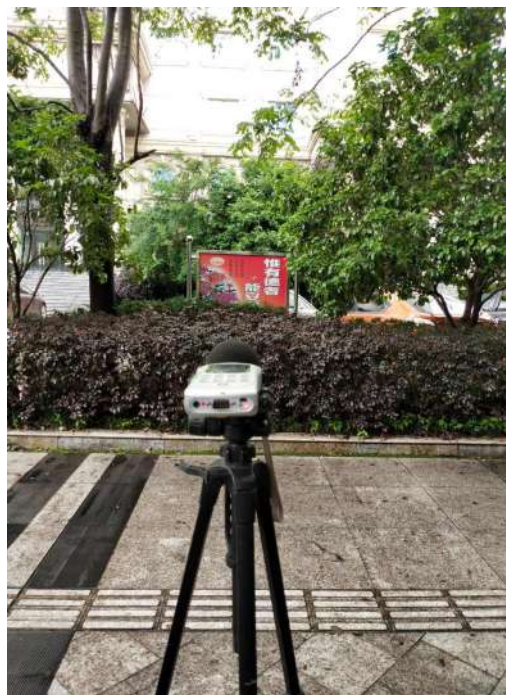
N12 Ji'an Civil Affairs Bureau