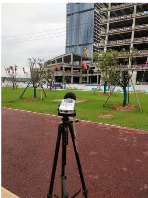
N1 Nan'an Village

Monitoring project: Equivalent continuous A sound level.