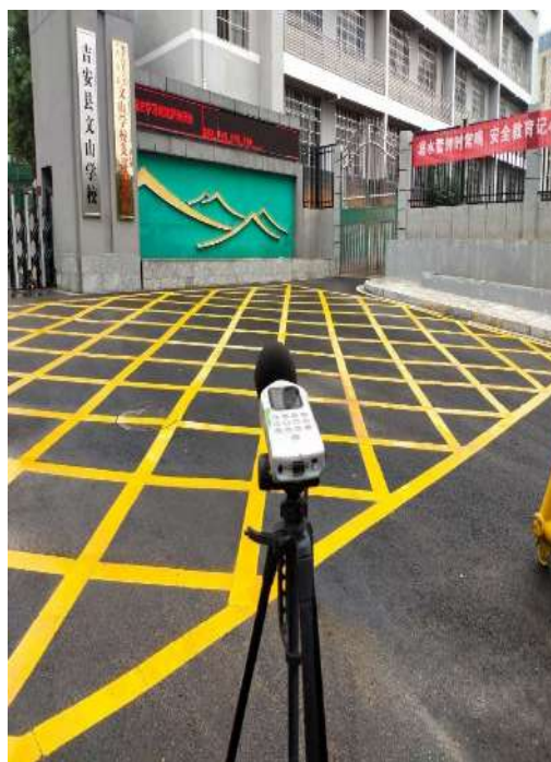
N2 Wenshan School