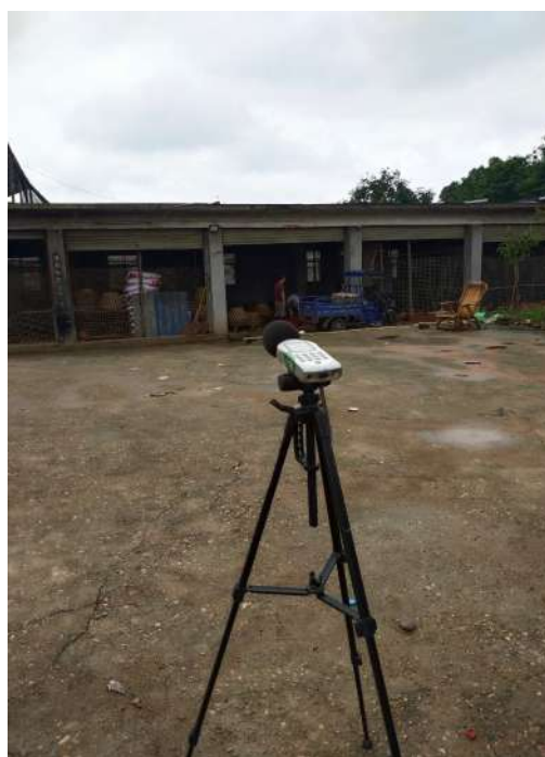
N2 Jiaogangling Village