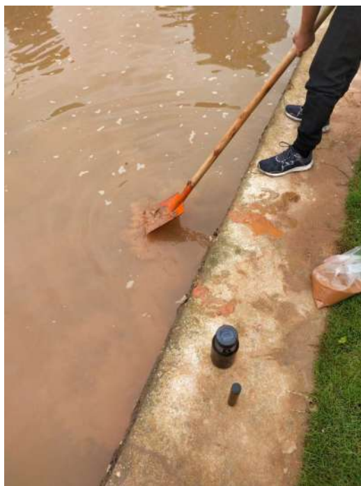
Dredging point of Yudai River

Monitoring items: pH, zinc, chromium, arsenic, cadmium, chromium (hexavalent), copper, lead, mercury, nickel, carbon tetrachloride, chloroform, methyl chloride, 1,1-dichloroethane, 1,2-dichloroethyl Alkane, 1,1-dichloroethylene, cis-1,2-dichloroethylene, trans-1,2-dichloroethylene, dichloromethane, 1,2-dichloropropane, 1,1,1,2-Tetrachloroethane, 1,1,2,2-tetrachloroethane, tetrachloroethylene, 1,1,1-trichloroethane, 1,1,2-trichloroethane, trichloroethylene, 1, 2,3-trichloropropane, vinyl chloride, benzene, chlorobenzene, 1,2-dichlorobenzene, 1,4-dichlorobenzene, ethylbenzene, styrene, toluene, m-xylene + p-xylene, o-xylene Toluene, nitrobenzene, aniline, 2-chlorophenol, benzo [a] anthracene, benzo [a] pyrene, benzo [b] fluoranthene, benzo [k] fluoranthene, pyrene, dibenzo [a , h] anthracene, indeno [1,2,3-cd] fluorene, naphthalene.