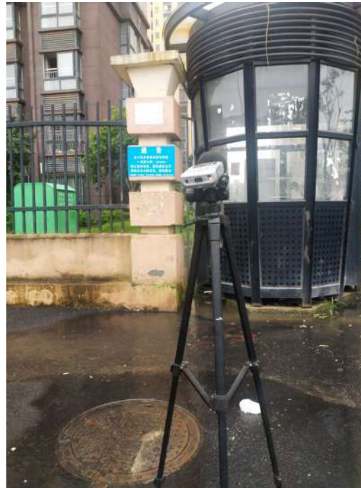
N7 Wuli Village