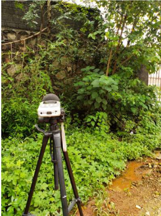
N3 Naoziling Village