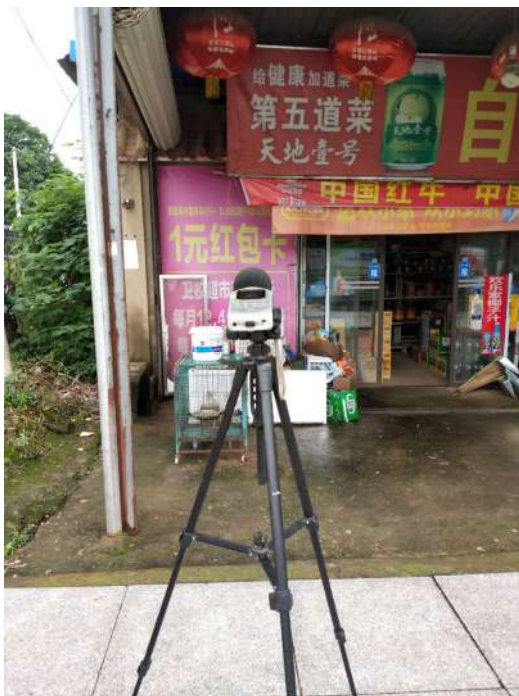
N4 Ji'an Occupational Health School