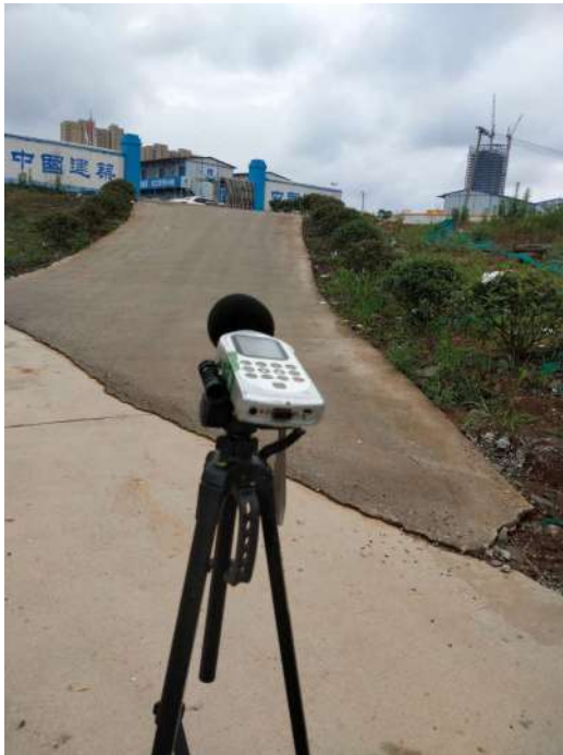
N6 Dujia fang Village