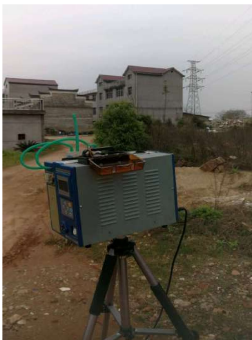
A1 Shili Village