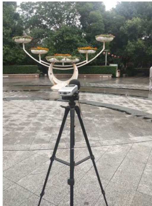
N10 People Square