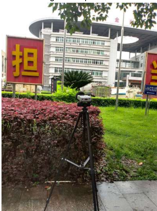
N1 Jinggangshan National Economic Development Zone Building

Monitoring item: equivalent continuous A sound level.