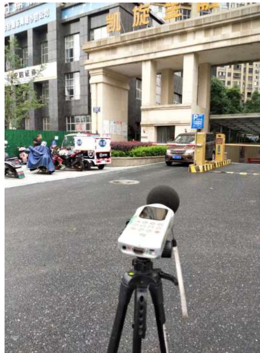
N6 Kaixuan Financial Center