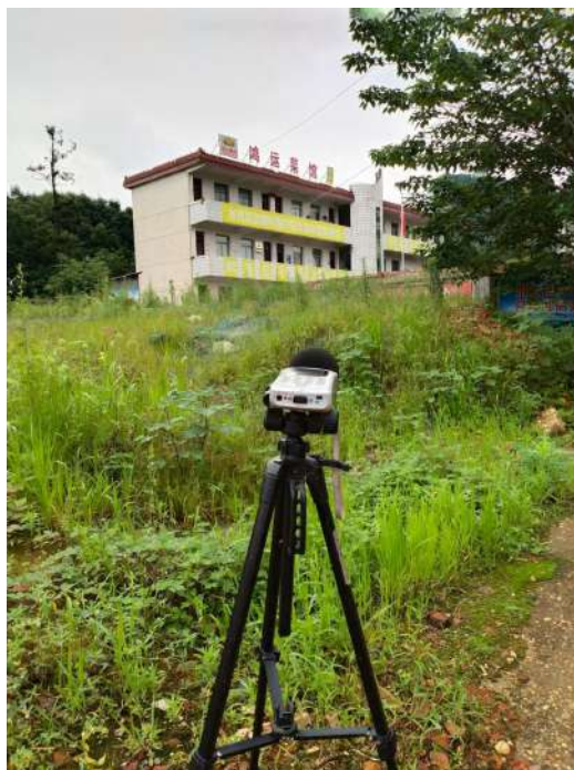
N3 Baitang Village