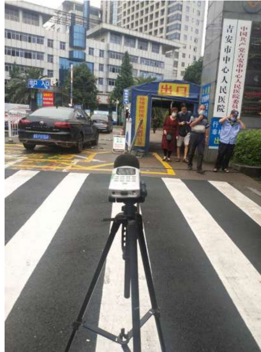
N8 Ji'an People's Hospital