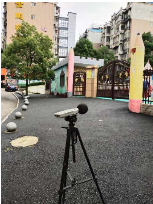
N11 Jinpeng Garden East