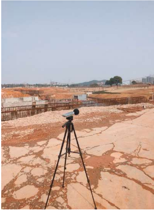
N1 Xiazhou Village