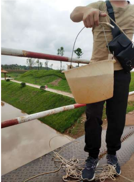
SW1 50m above water body