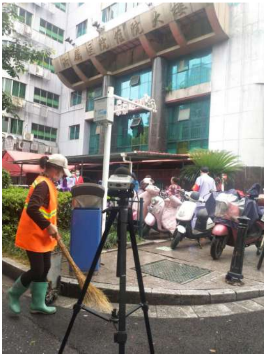
N9 Jinggangshan University Affiliated Hospital