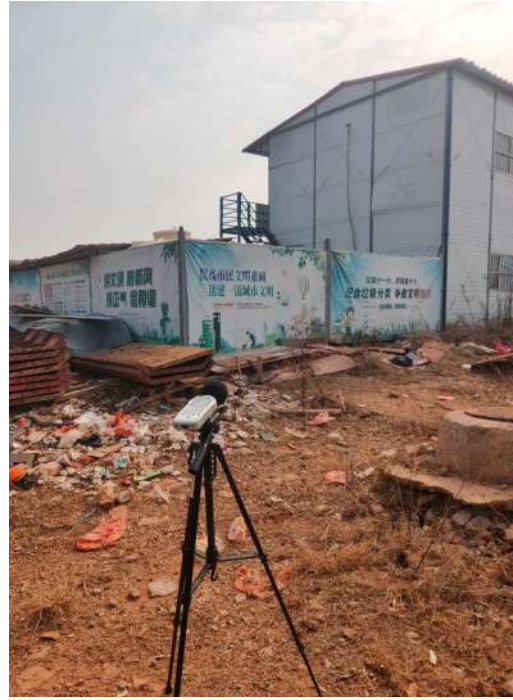
N2 Chunqian Village