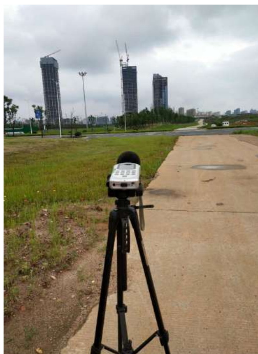
N2 Dongtou village