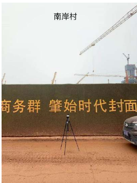
Nan'an Village N1