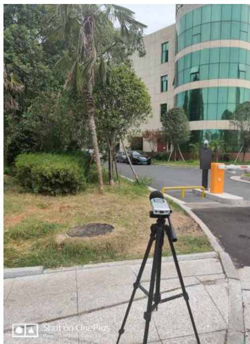
,N14 construction site.