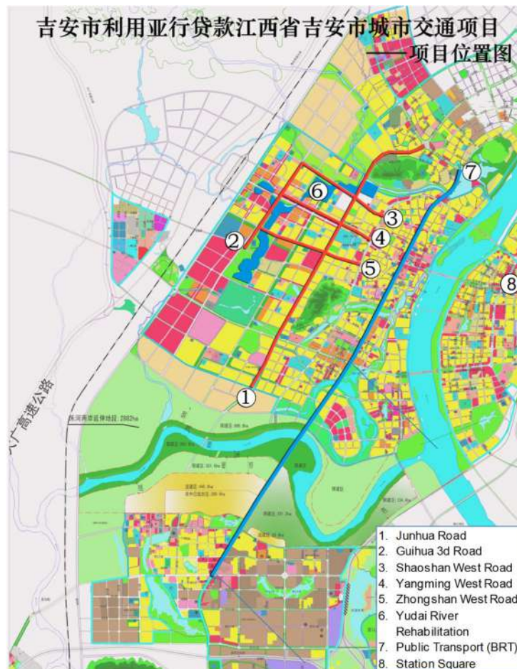
Picture: Project location

26 . According to the construction conditions of various roads, the monitoring contents include the surface water quality monitoring of the Yudai River crossing the water body (Shaoshan West Road and Boyan Avenue), and the air quality environmental monitoring of sensitive points during the construction period (Junhua Avenue, Yangming West Road, Zhongshan West Road , Shaoshan West Road and Boyan Avenue), noise monitoring of sensitive points during the construction period (Junhua Avenue, Yangming West Road, Zhongshan West Road, Shaoshan West Road, Boyan Avenue and BRT Road). The samples of water, air, soil, etc. were collected and sent to lab test. The samples were analyzed and tested in time, and noise was monitored on site.