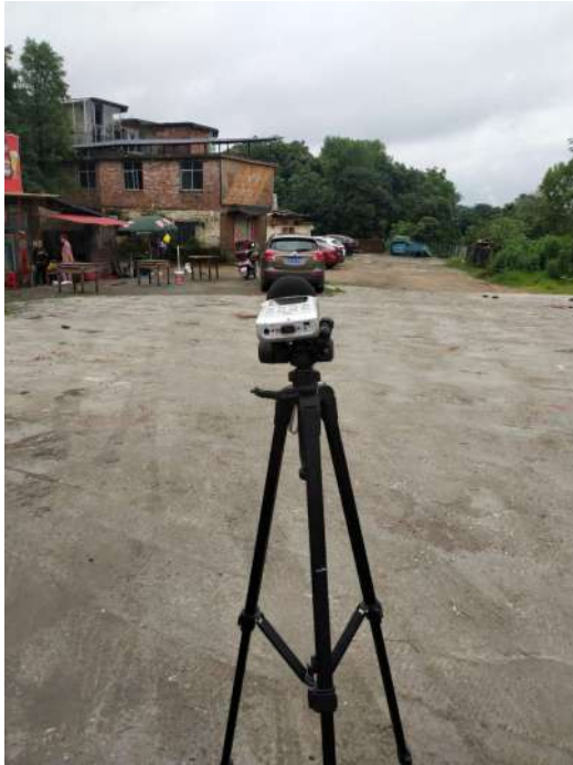
N3 Xinfeng Village