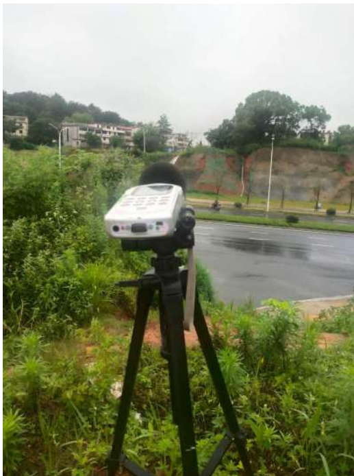
N8 Shihuling Village