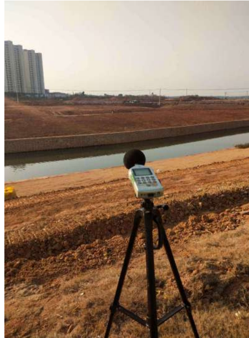
N4 Zhongshan West Road construction point