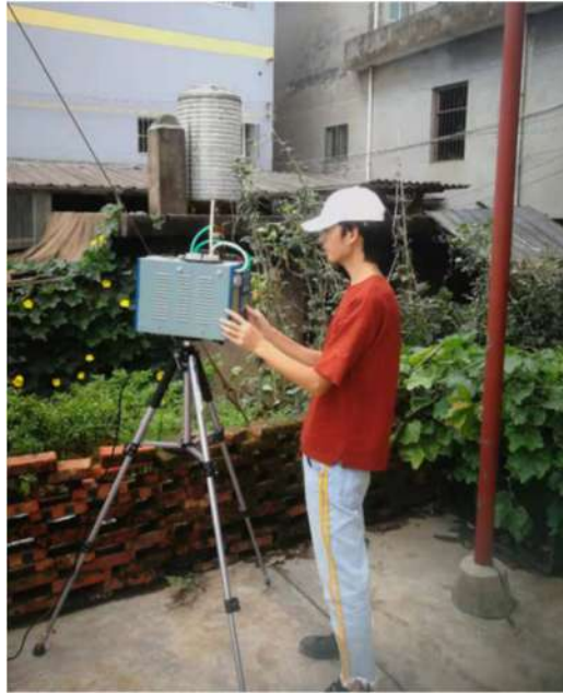
A1 Nan'an Village