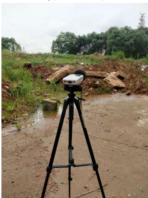
N1 Laoyangjia Village

Monitoring parameter: Equivalent continuous A sound level.