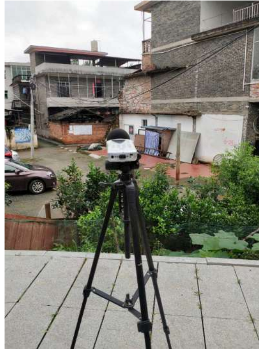
N4 Jiangjiafang Village