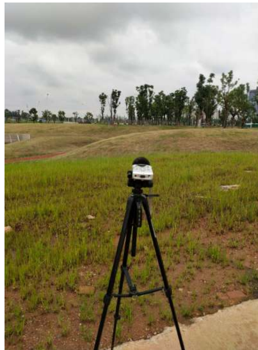
N4 Maobei village