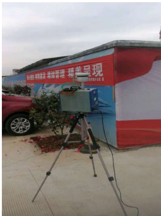
A1 Cunjian Village