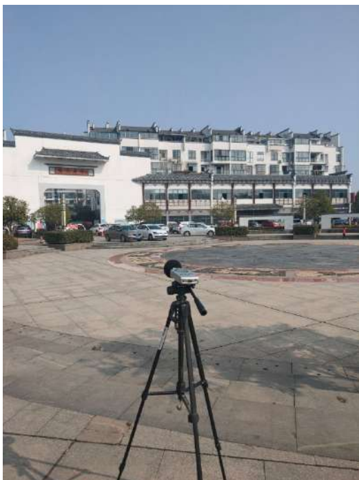
N13 Luzhou Mansion