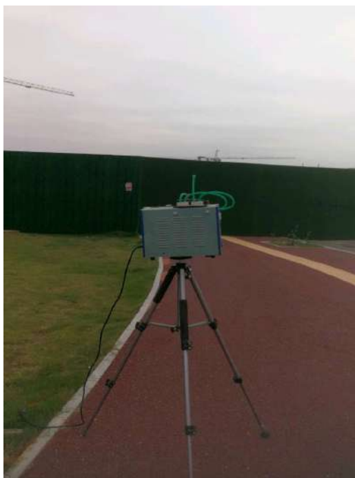
A1 Nan'an Village