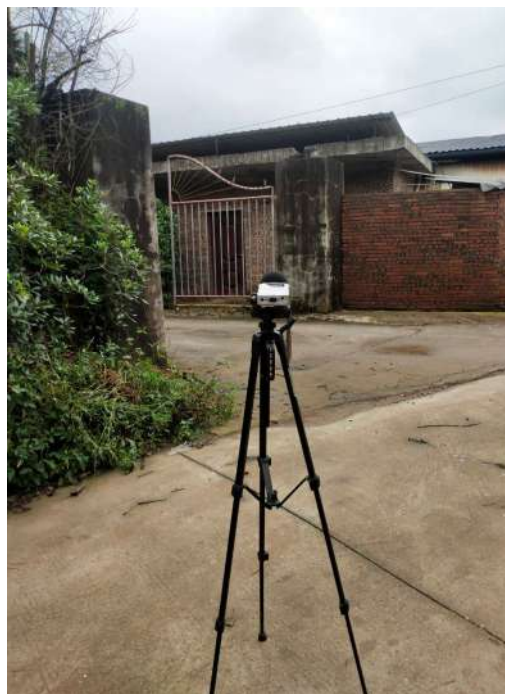
N2 Shili Village