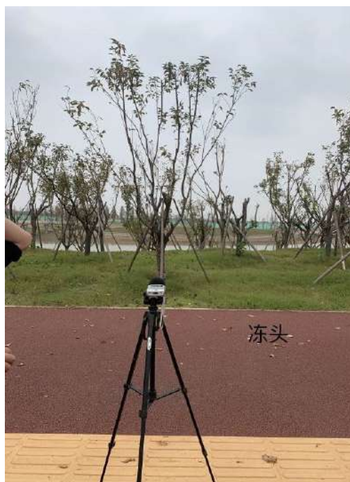
Dongtou village N2