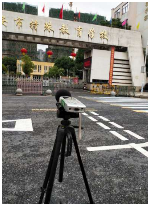
N5 Ji'an Special Education School