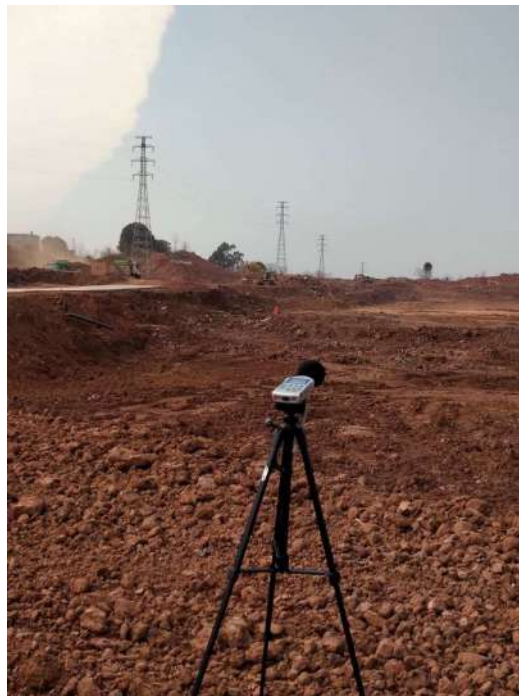
N3 Shaoshan West Road construction point