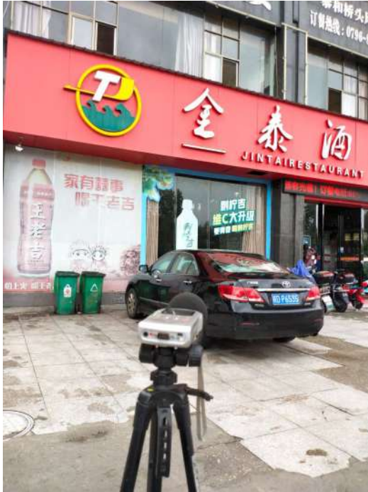
N7 Shangrao Family