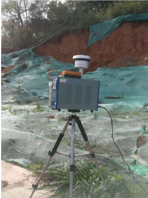
A1 Jiangbian Village