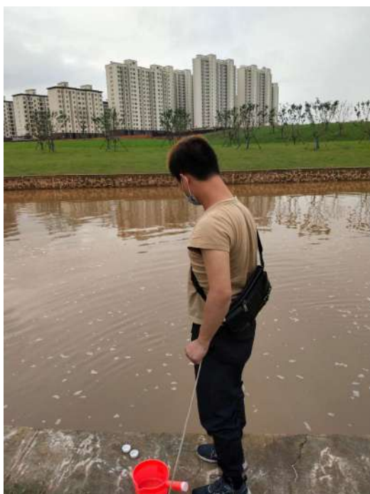
SW1 50m above water body

Monitoring parameter : pH value、Suspended matter、COD、Ammonia nitrogen、Petro、Fecal coliforms