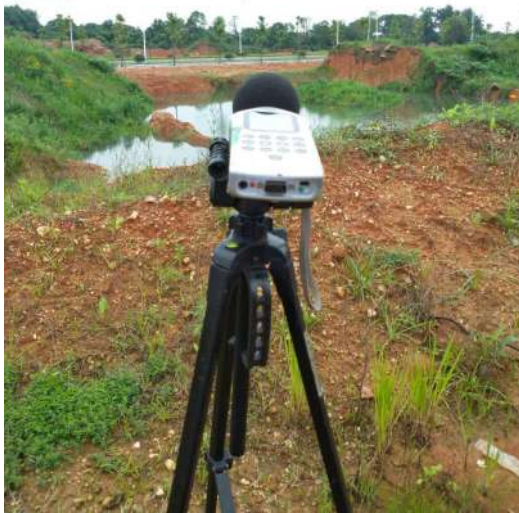
N1 Luogang Village