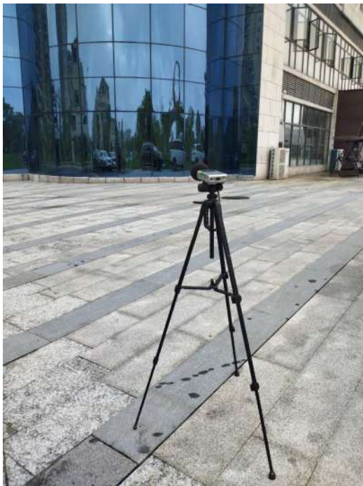
N5 Taqian Village