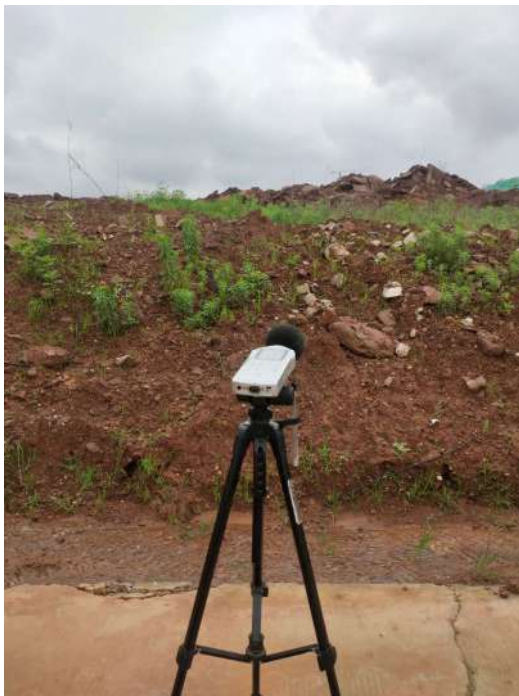
N3 Chengshang village