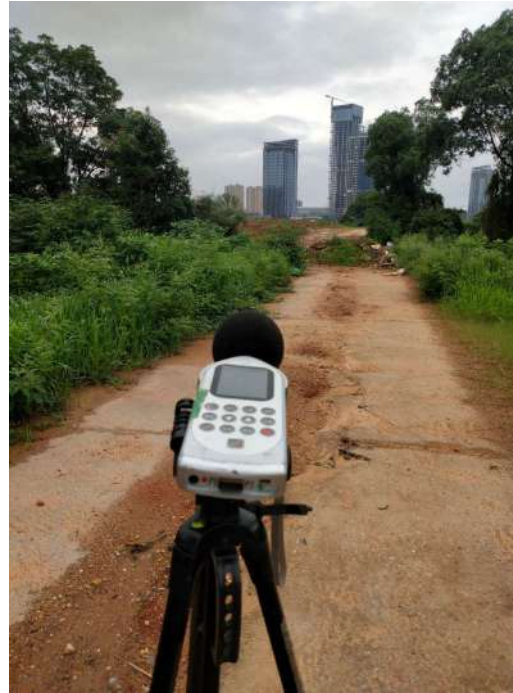
N2 Jiangbian village