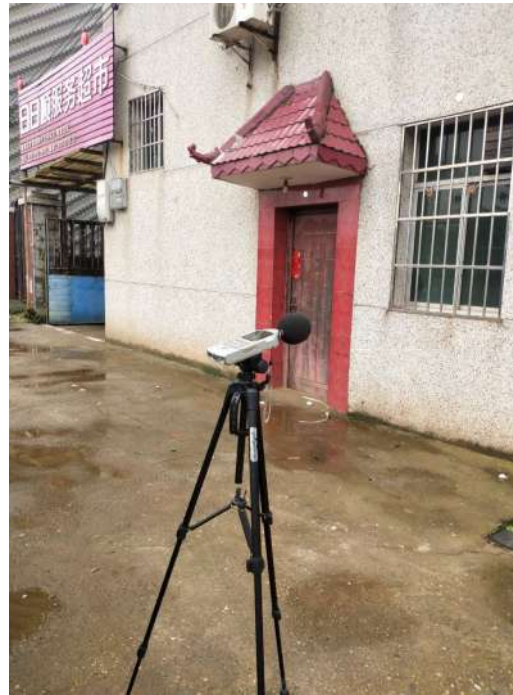
N6 Luotangtou village