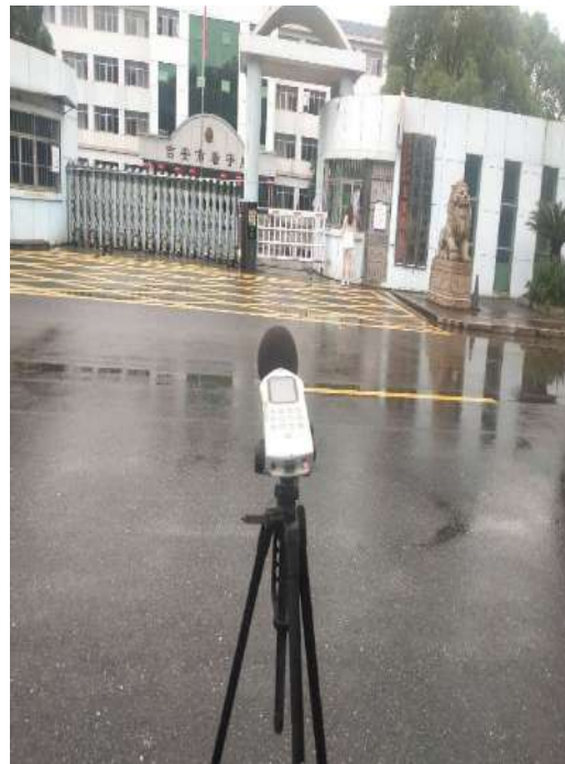
N9 Detention center