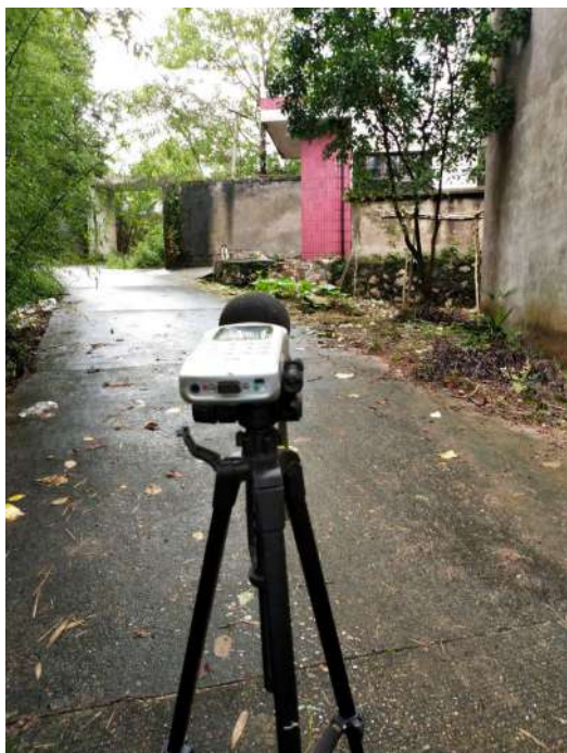
N1 Henglongpengxia Village

Monitoring parameter: Equivalent continuous A sound level