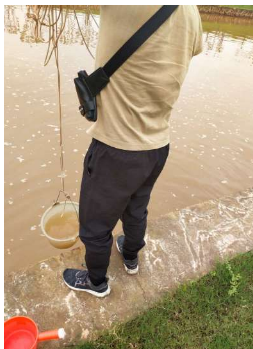
SW2 100m downstream of the water body