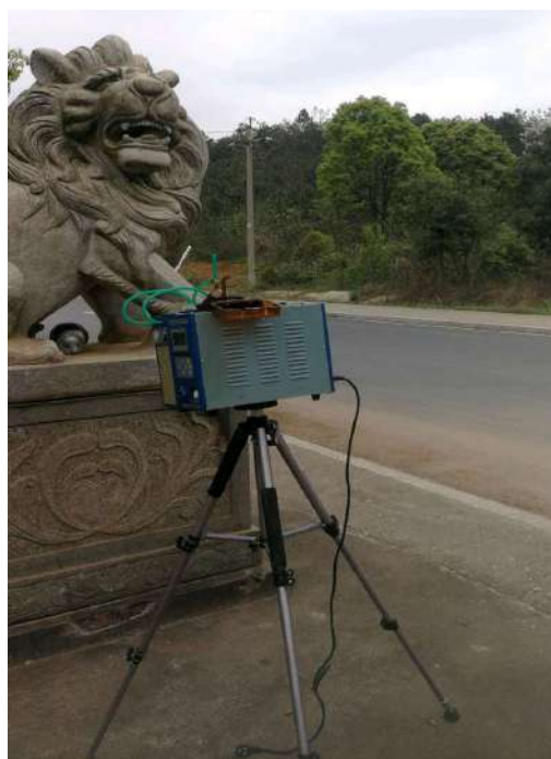
A2 Detention center