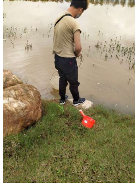
SW2 100m downstream of the water body