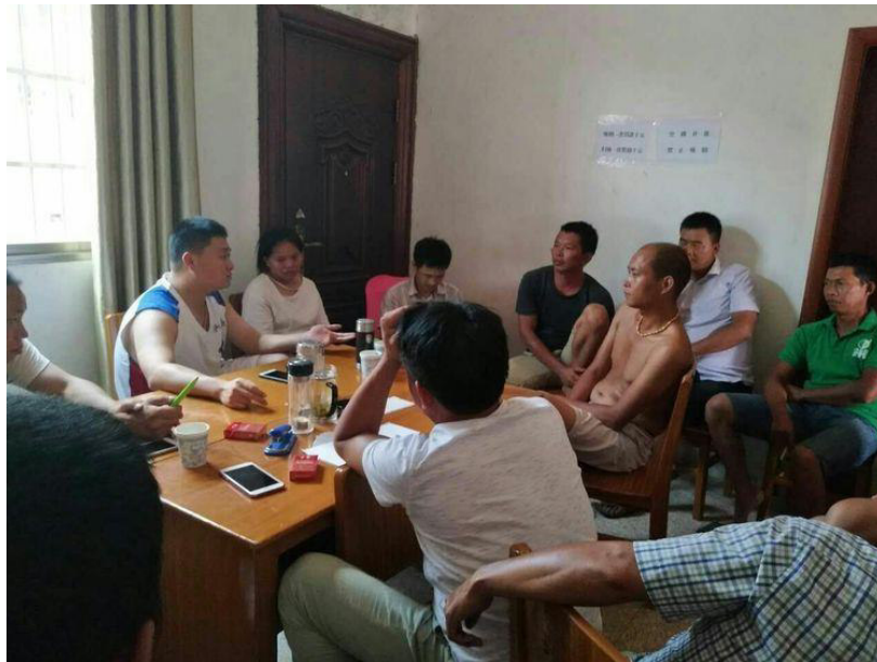
Figure 6-4 Policy advocacy conference organized by working group of HD in Xingqiao town