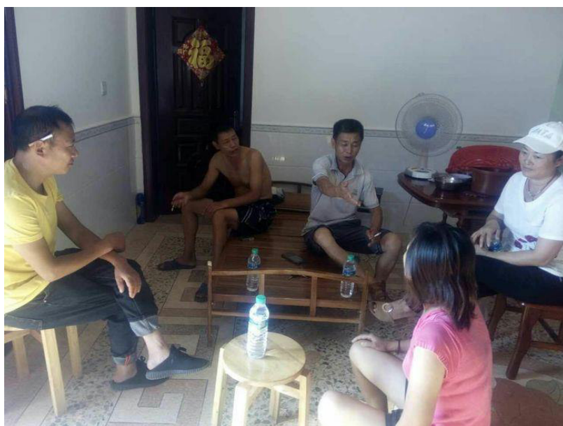
Figure 6-5 Publicizing policy of LA, HD and resettlement in Chengshang village

With the continuous progress of project preparation and implementation, JUCIDC will carry out consultation activities, the main contents of consultation include