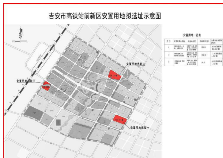
Figure 7-2 Location Map of New Zhanqian Community