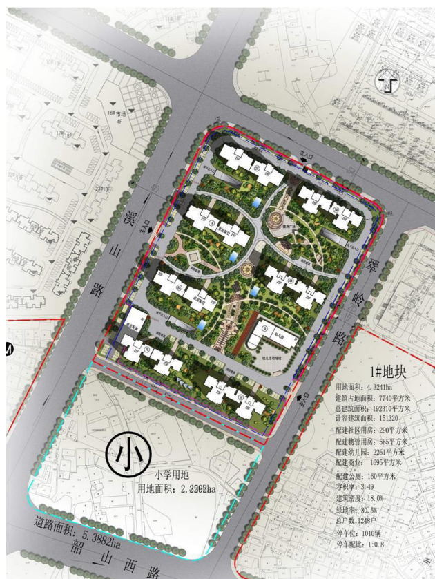
Figure 7-1 Plan Map of Wuli Resettlement Community

Wuli Resettlement Community covers planning area of 43,241 m 2 and building area of 7,740 m 2 with 1,248 apartment units and 4,368 persons. The resettlement housing will be finished in July 2017.