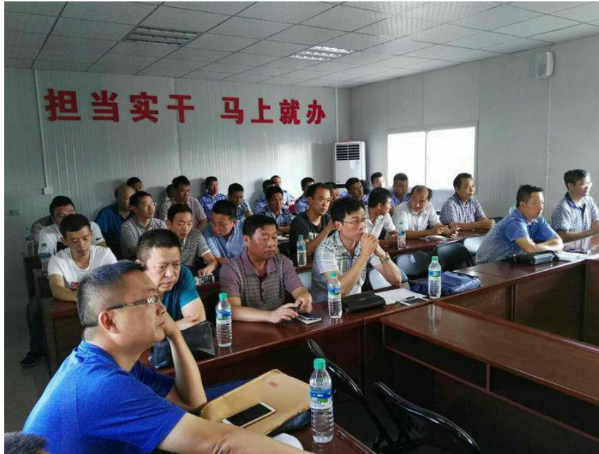
Figure 6-3 Training policies of LA and HD