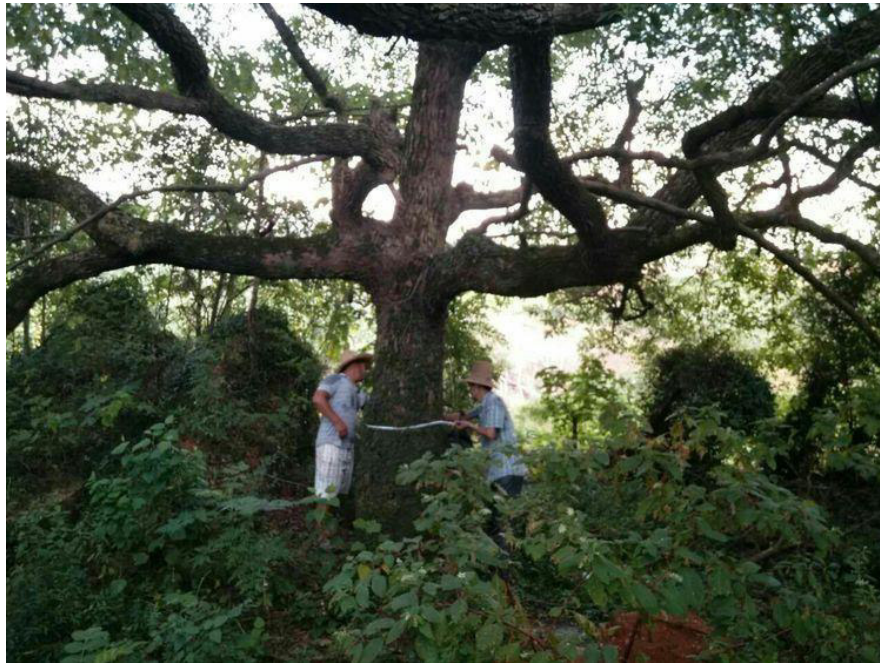
Figure 6-2 Technicians of district forestry bureau evaluating camphor trees in Dongtou village