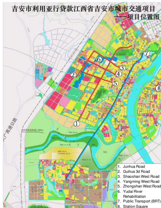
Figure 1-1 Sketch Map of Road Distribution

The work methods of the updated RP include field measurement, physical quantity survey, related government departments survey, affected organizations and APs interview.