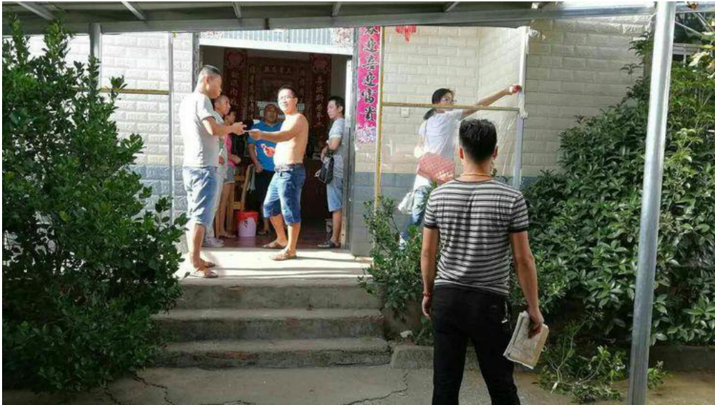
Figure 6-1 Housing mapping and evaluation