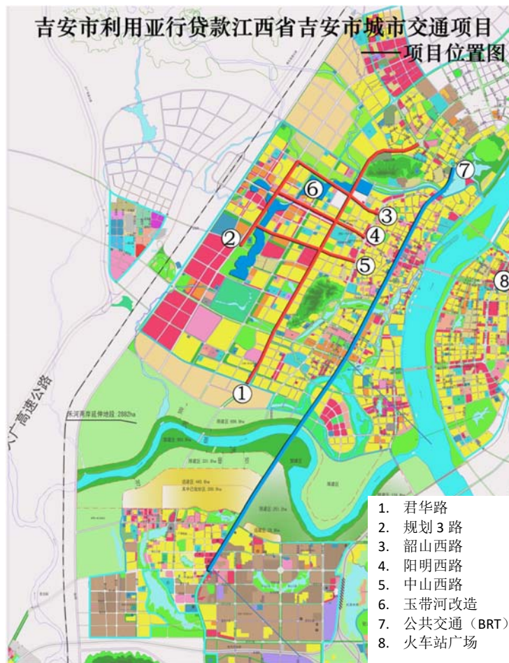
Figure 1-1 Locations of the Project Components

The Project is aimed at increasing Ji'an social and economic development, for example, speeding up Ji'an sustainable development, decreasing the gap between Ji'an and other developed cities in China, providing opportunities of phase skipping changes for the whole public transportation in Ji'an (for all users), assisting construction of integrated, high-quality, high-efficient and multifunctional new city combined with land use plan, and improving the capability to guard against flood disaster.