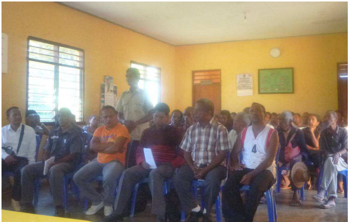
Figure 2 Public Consultation in Suco Liho, District of Ermera, Sub-District of Railaco where the AP's aired their issues and Concerns to the Representatives of the Consultant and PMU.