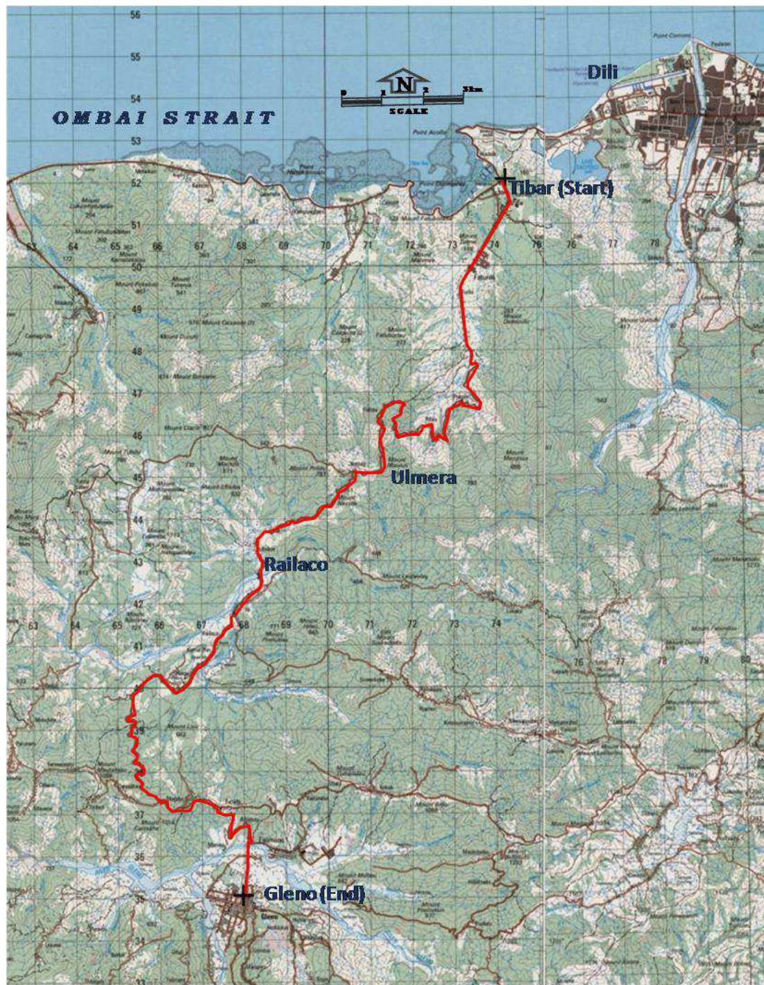
Figure 1 Location Map of the Tibar – Gleno Road