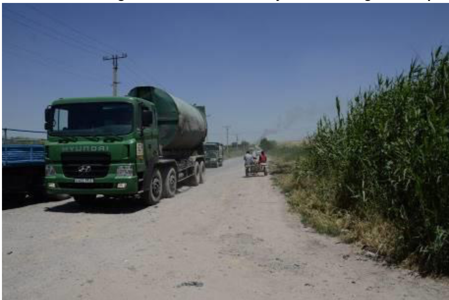
Access road to Akhangaran Landfill

51. The environmental safeguard consultant, NIE Mingtao of CUCD, was fielded in Tashkent through 17-27 May 2019. The main purpose of this field work is to prepare the initial environmental examination (IEE). The environmental safeguard consultant visited the project sites; attended various meetings with the project proponents (Maxsustrans and Waste Disposal and Utilization), CUCD team's project management and design staffs, local design/geological/hydraulic survey institutes (TMM and its subcontractors), PIU consultant (Gauff) and the capacity building consultant environmental specialist; and prepared relevant documents. The following summarize the main findings and recommendations during this field work.