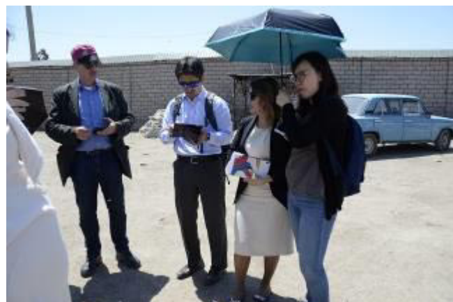
Discussion of design decisions with Sanitary Landfill Design and Supervision Consultant