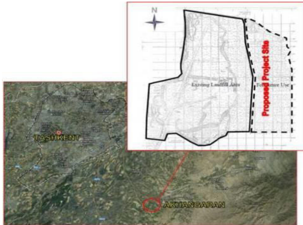
Figure 1. Location map of Akhangaran landfill

20. Access to the site: Land acquisition for the expansion of existing landfill will not require construction of any additional access road to the site. This is visualized below on given image ( Figure 2 below). Access to land will be through already functioning road. Existing access and other bypass roads should be taken in consideration for repair- and reconstructions works. Buffer zone for the SLF will be within the acquired land plots.