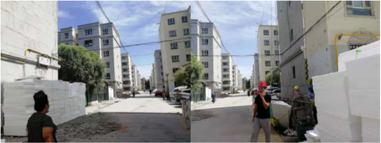
Heat insulation in old city area