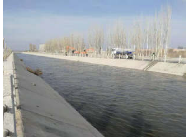
Protection forest Planting