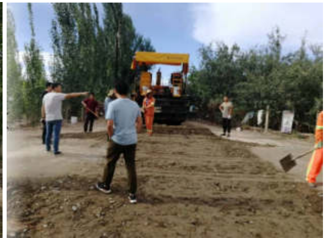
Road Under Construction