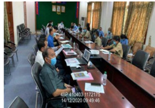
meeting and on-site visit Governor's committee for land title of WWTP, on 14 December 2020