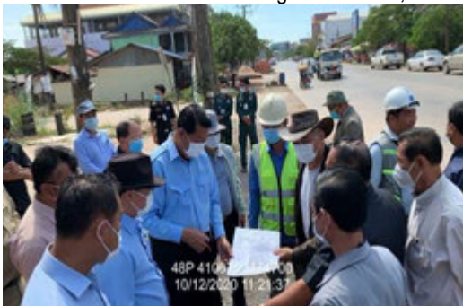
Site visit Governor's committee for construction works, on 10 December 2020