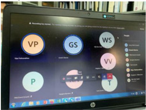
Video Attendance of the Meeting December 2, 2020