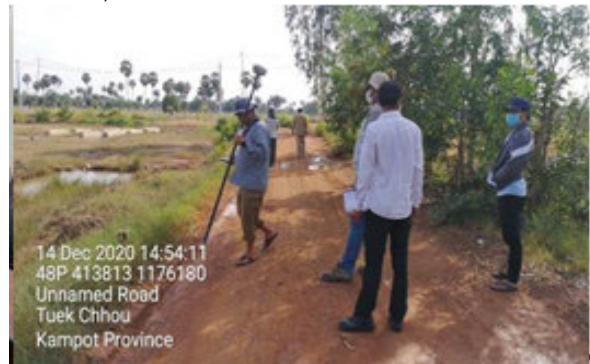
Site visit Governor's committee for land title of WWTP, on 14 December 2020