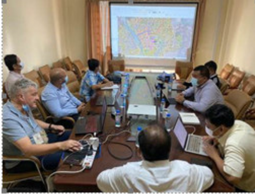
Meeting room with PMU on Project Scope Change for CW01, on 02 and 09 December 2020