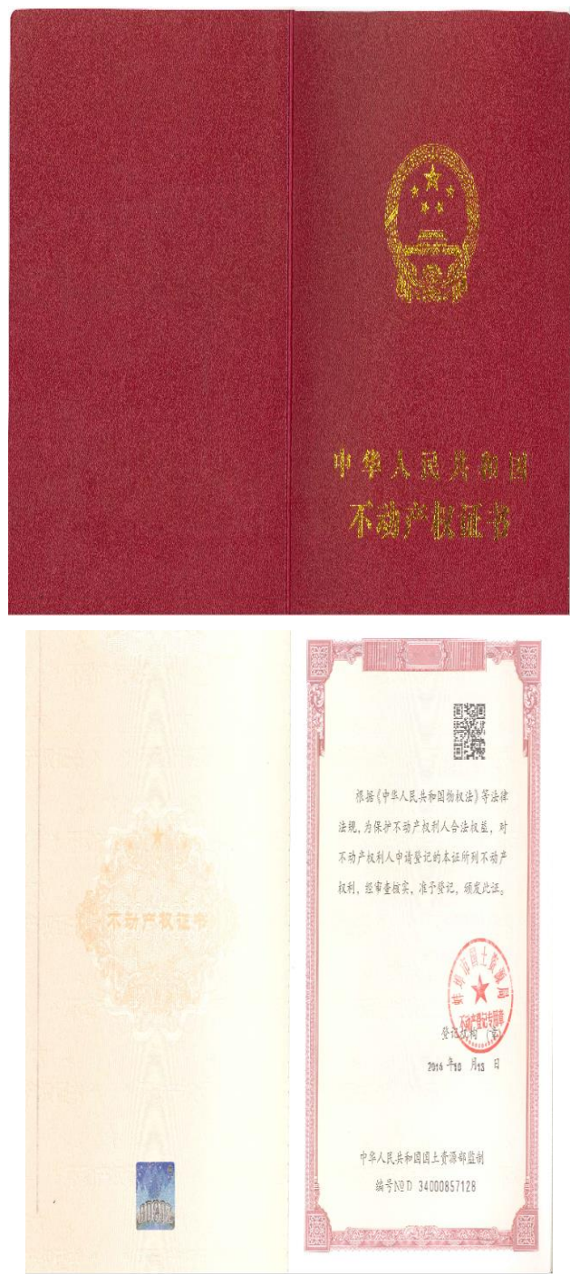
Figure 8- The Immovable Property Certificate