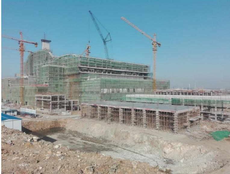
Figure 6- Access Road