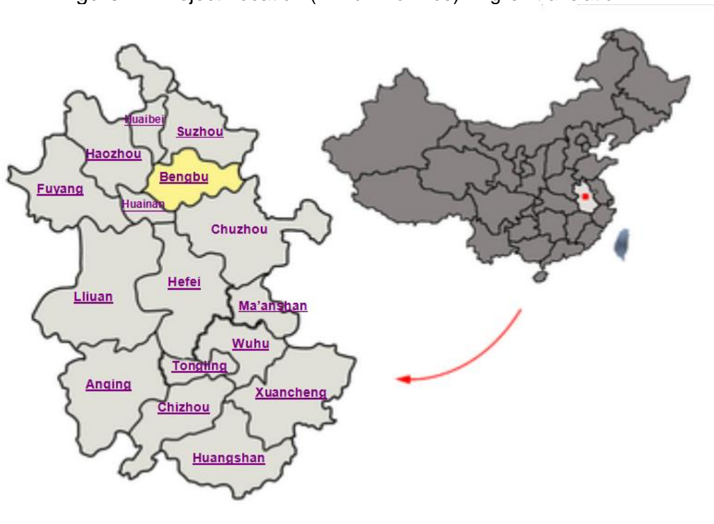
Figure 1- Project Location (Anhui Province)-English translation

5. On August 4, 2015, Bengbu City Government and Dynagreen signed the Build-Operate-Transfer (BOT) agreement to construct the Bengbu Waste-to-Energy (WTE) plant. According to the BOT agreement, all land acquisition and resettlement activities will be implemented by the local government. The proposed Bengbu WTE Plant has a daily treatment capacity of 1000 tons of urban waste, and an annual generating capacity of 116.55 million kWh. The total investment of the Project is RMB 503.97 million.