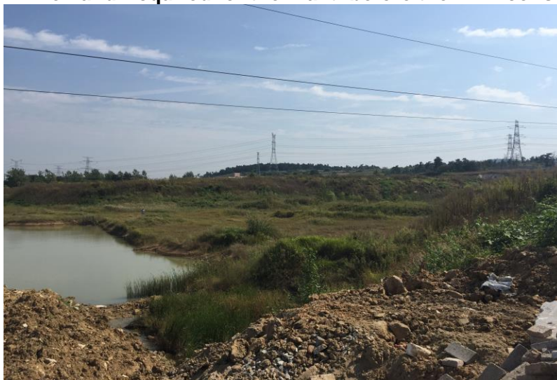
Figure 4-The Land Acquired for the Plant- before the WTE construction

The picture above shows the shallow pond that were dug to provide soil for original landfill plant contribution. The shallow pond was within the landfill site and was far from the nearby residents and thus has no influence on the residents. This shallow pond is been filled in the process of land leveling by Bengbu Dynagreen.