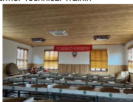
Figure 4 Fu'an City tea processing training