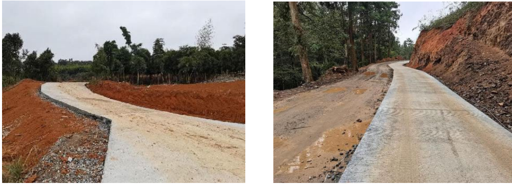
Figure Site construction photos

1) 1000 mu of tea garden leveling (variety) replanting, 3800 mu of tea garden road infrastructure construction has completed 100% of the total amount of work(FJ-FANK-CW-01-01-);