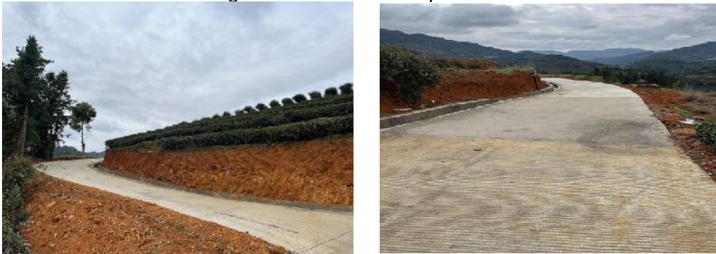
Figure Site construction photos

1)5,678 mu of high-quality rice base in Fuling Town-Infrastructure renovation project( FJ-PC-CW-01) construction has completed 70% of total construction.