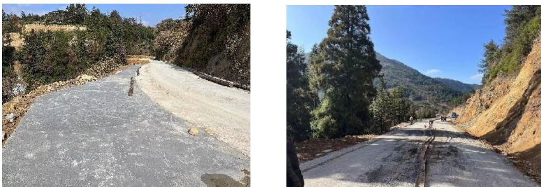
Figure Site construction photos

7)Four new construction contract packages are being designed.