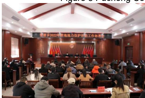
Figure 3 Pucheng County Farmer Technical Trainin