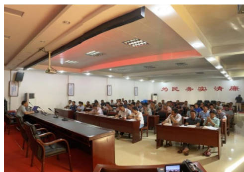
Figure 2 Farmer Technical Training in Dada County