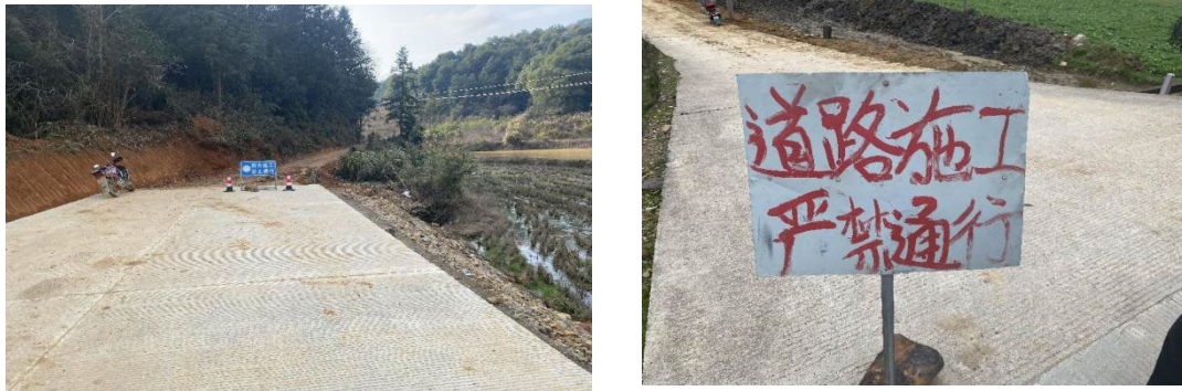
Figure Site construction photos

1)Lingxi Township-Infrastructure Improvement Project (FJ-SN-CW-01) has completed 72% of the total construction volume;