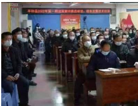
Figure 1 Farmer Technical Training in Pinghe County