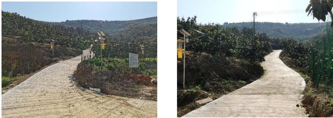
Figure Site construction photos

3) Civil construction contract packages FJ-PH-CW-07, FJ-PH-CW-08, FJ-PH-CW-09, FJ-PH-CW-10, FJ-PH-CW-11, FJ-PH-CW-12 are still in the preliminary design stage.