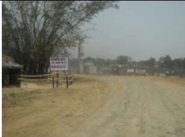
Diversion Safety Information Boards