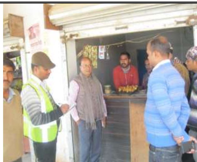
View of community consultation conducted along the project road.