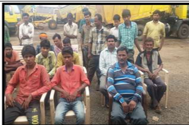
A view of Public Consultation Program.