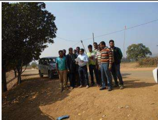
Social and environment expert documenting view of participants during site visit at village Bhawdar (Ch.34.600)