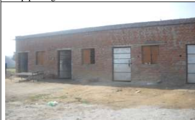
A View of Labor Camp