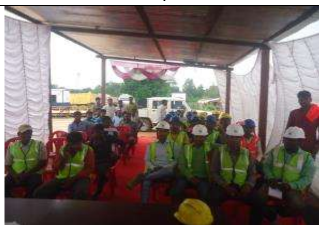
View of AIDS Awareness Program Construction Labor Camp.