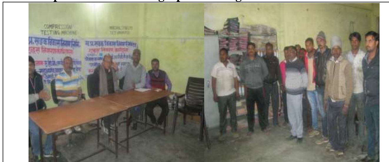
View of HIV/AIDS awareness program conducted at contractor's construction camp during reporting period.