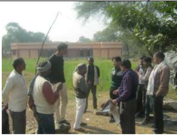
View of public consultation along the project road