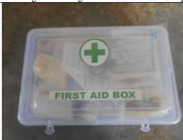
First Aid Box at Construction Camp