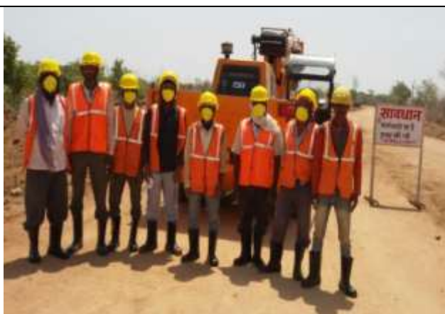
View of Personnel Protective Equipment during Construction.