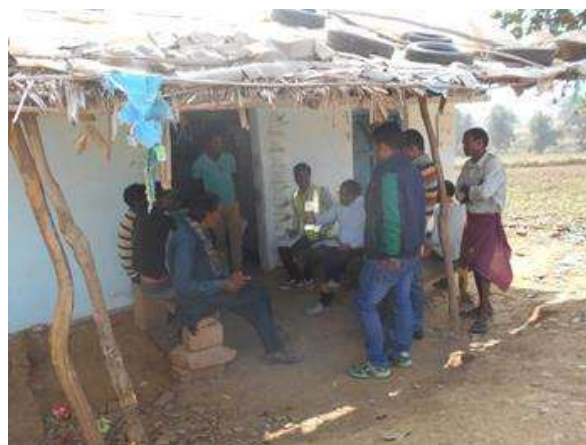
A view of environment/ social expert briefing road construction benefits with local shop owners at Gangi market area (Ch.35.000)