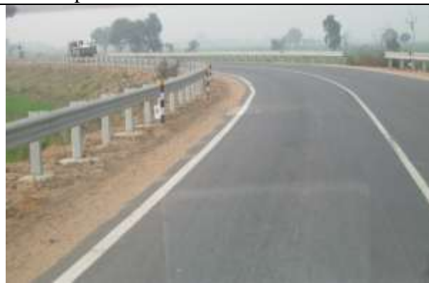
View of completed section of project road.