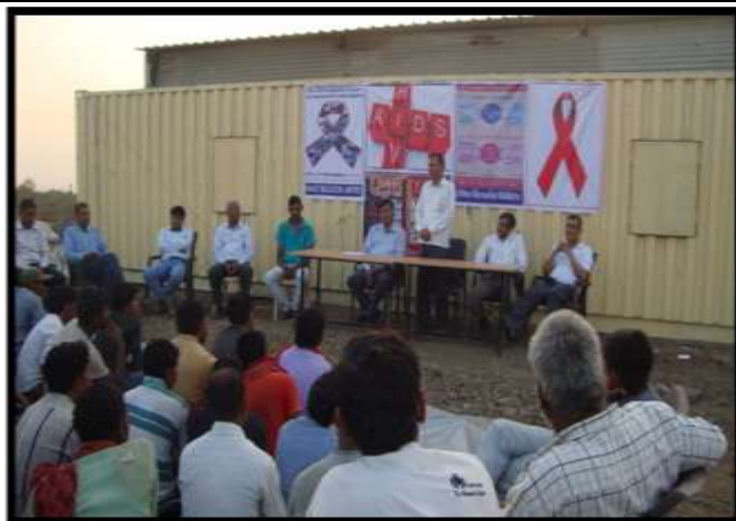
HIV/AIDS awareness program conducted at contractor's construction camp on dated 28.11.16