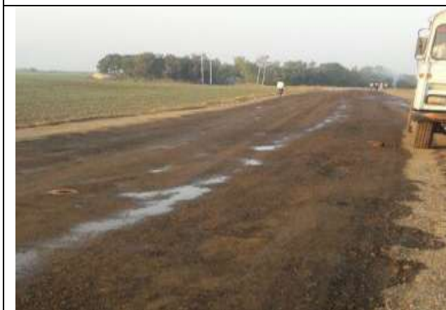
View of dust controlling