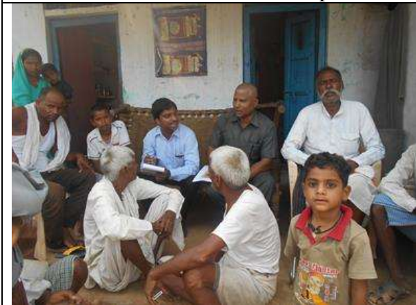
Local people expressing their deep happiness at village Masoodpur during public consultation.