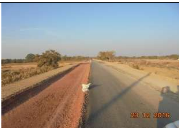
View of Construction