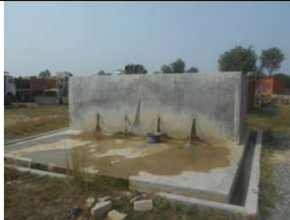
Washing and Bathing Place at Construction Camp