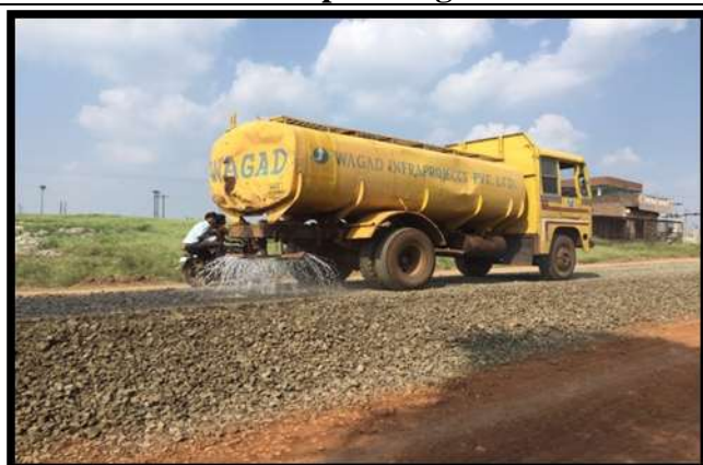
A view of water sprinkling to avoid access dust.