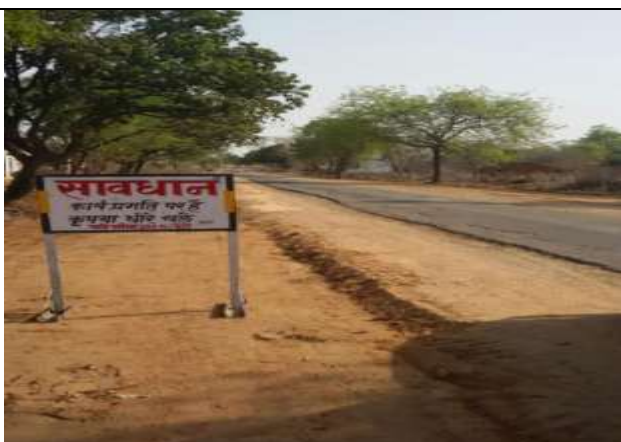
View of road safety sinages