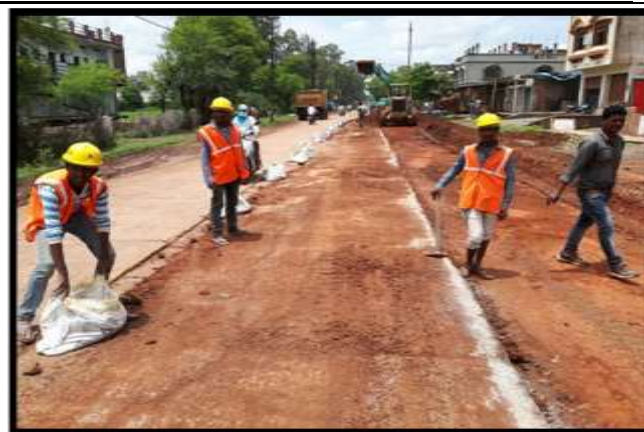
Use of PPE during Civil Construction Works