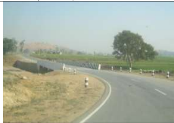
View of completed road.