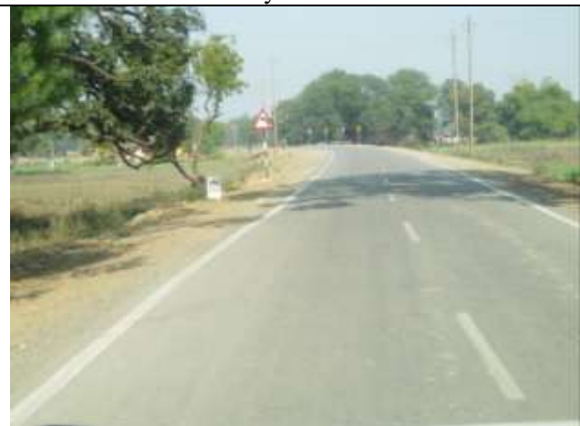
A view of completed road.