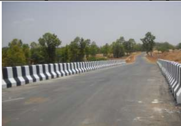
A view DBM completed road section of the project.