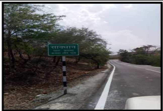
A view of informatory board along with the road construction works.