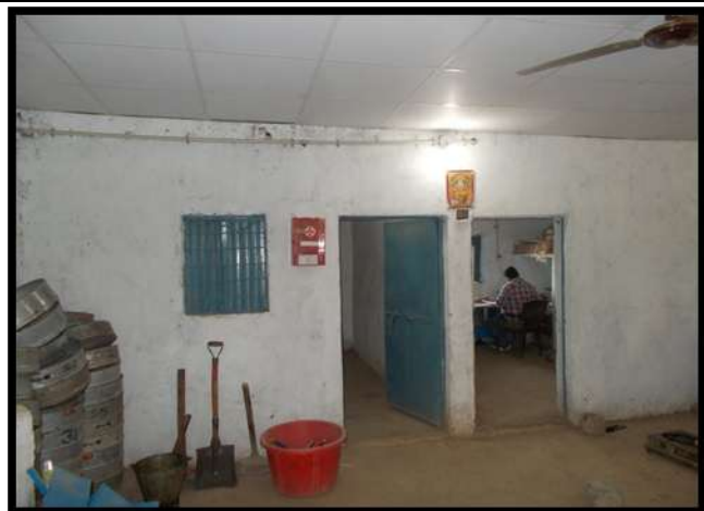
Accommodation provided to workers at camp site along with first aid box.