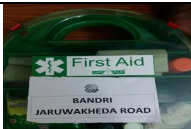
View of First Aid Kit Availability work construction and labor camp site.