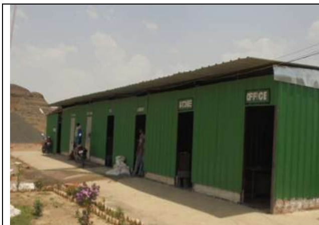
View of Construction Camp.