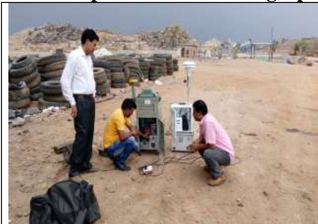
View of ambient air monitoring at construction camp package-c.