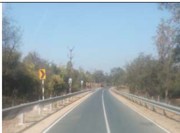
View of constructed Road Marked Paint & Sign Board