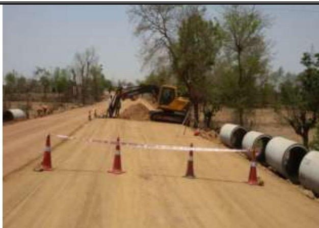
View of Sign board and warnings board.