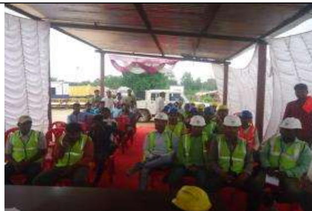
View of AIDS Awareness Program Construction Labor Camp.