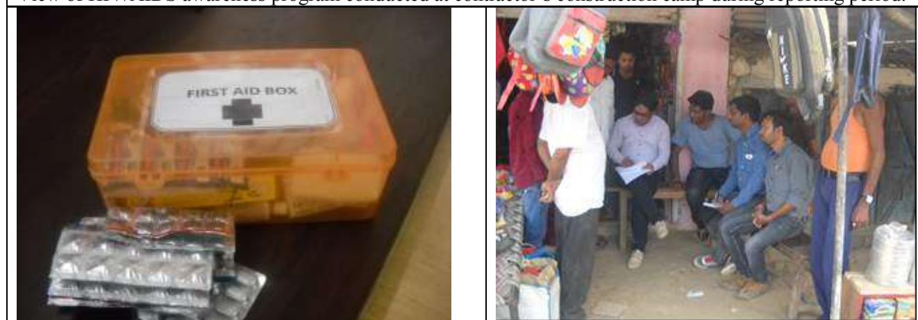
First Aid Box Available at project construction camp.