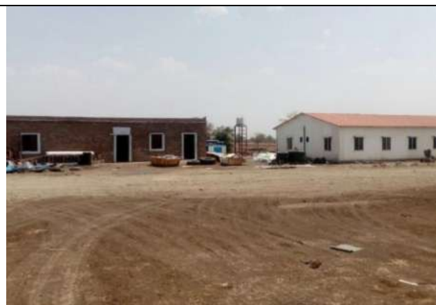
View of Construction Camp.