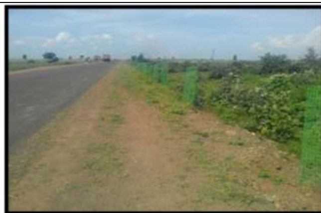
A view of tree plantation along with tree guards along the ROW