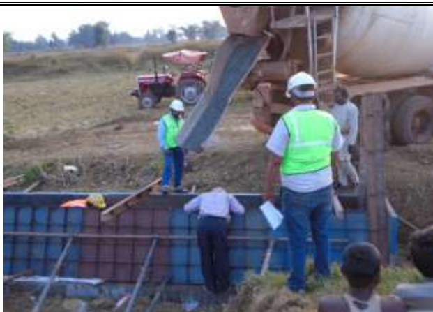
View of Safety Jackets during work.