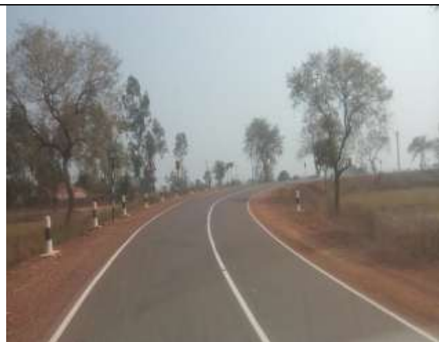
View of constructed Road Marked Paint & Sign Board.