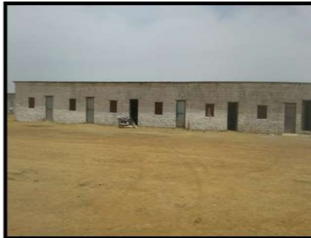
Accommodation provided to the workers