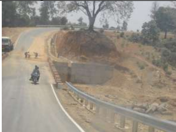
View of Road diversion signage placed at construction site.