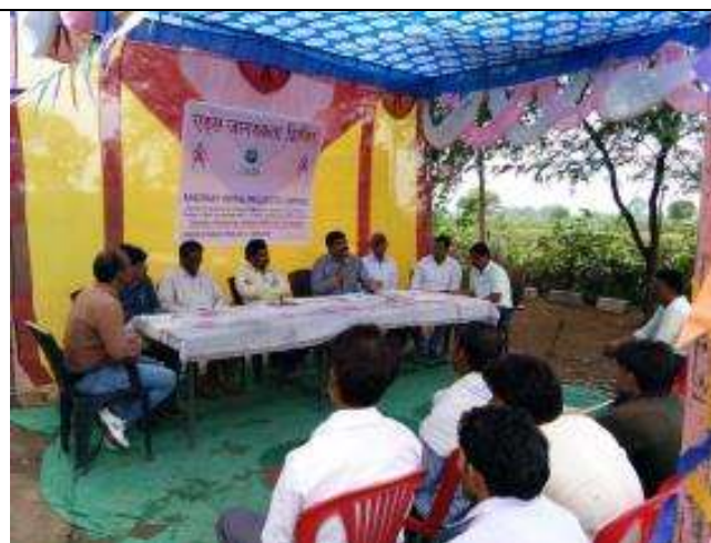
View of AIDS Awareness Program Construction Labor Camp.