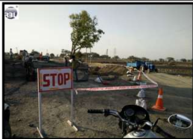
A view of Diversion used during civil construction work.