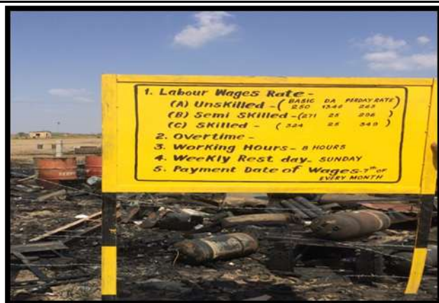
A view of Labor wages display board