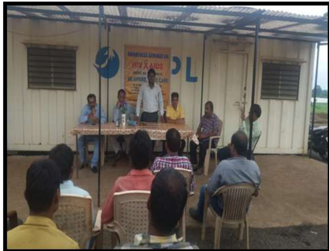
A view of HIV/AIDS awareness program