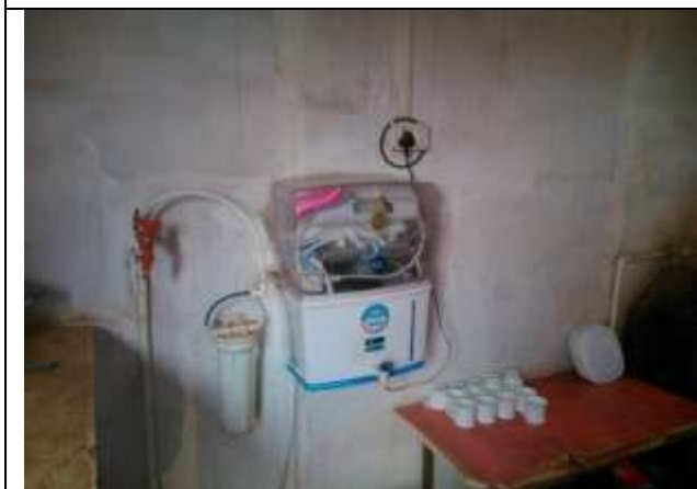
View of Drinking Water Facility