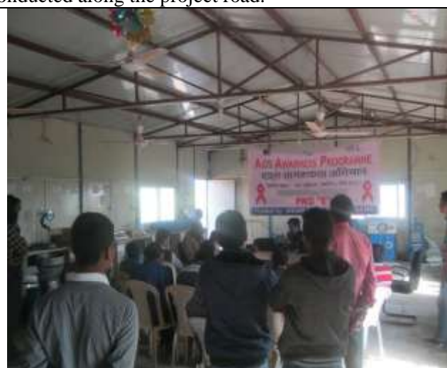
HIV/AIDS awareness program conducted at construction camp.