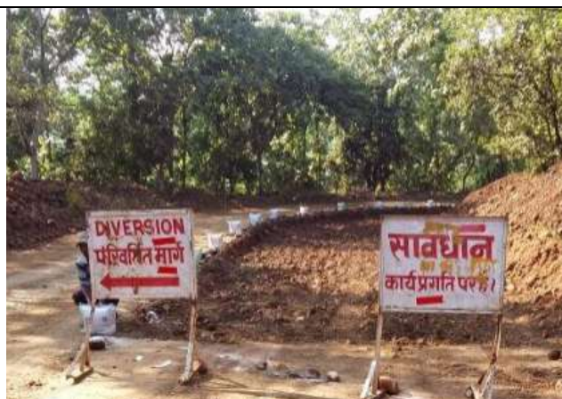
View of road safety sinages and Diversion.