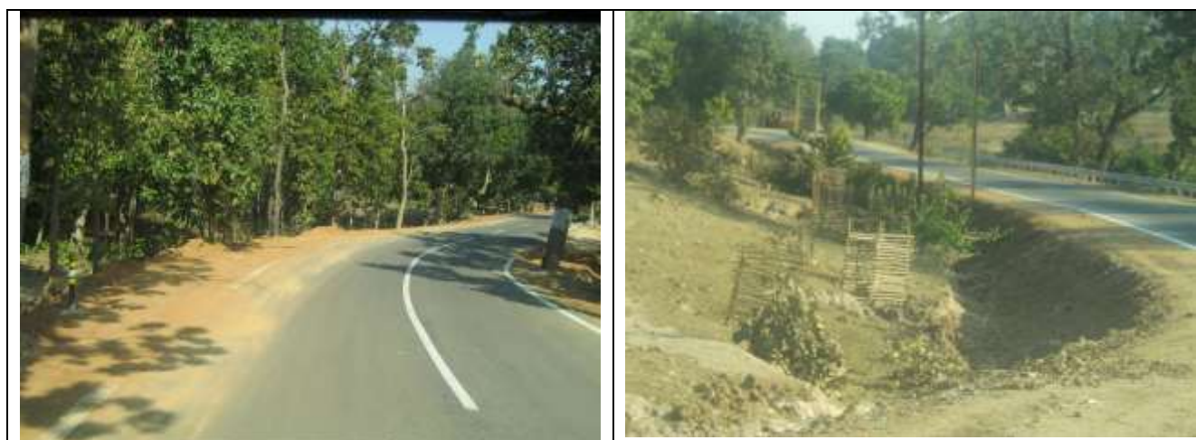
View of saved trees along the project road section, passes through forest area.