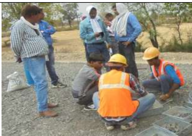
View of Personnel Protective Equipments during Construction.