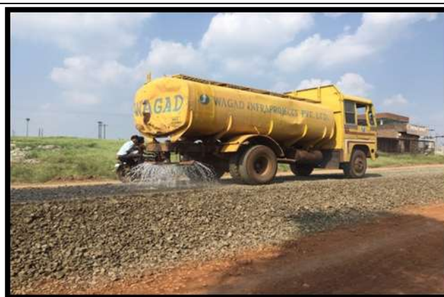
A view of water sprinkling to remove acute problem of dust and residual particles in air during the reporting period.