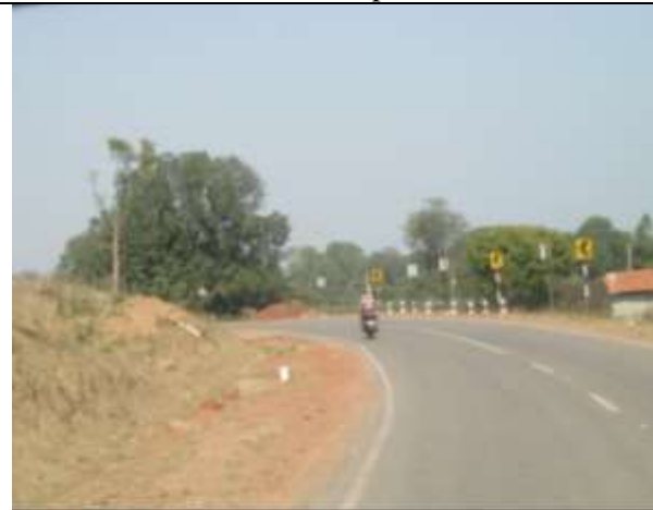
A view of completed road.