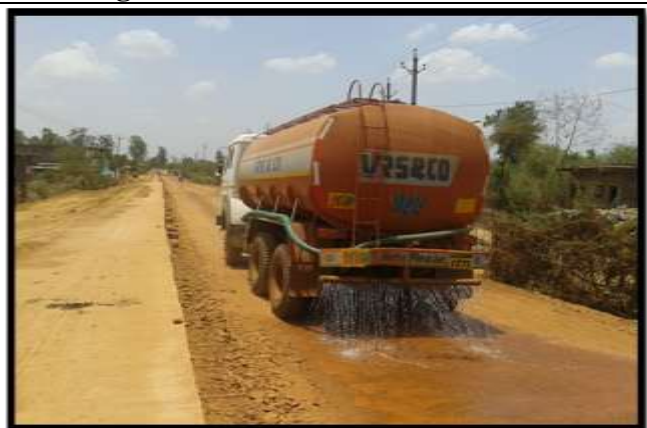
Water sprinkling during civil construction works