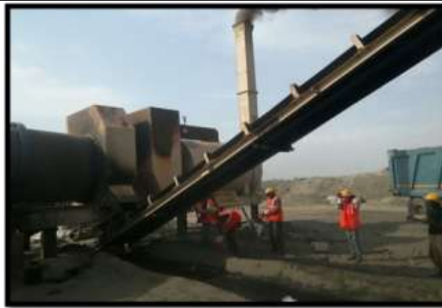
Used of PPE during plant operations