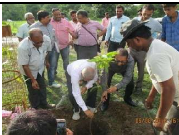
View of Tree Plantation.