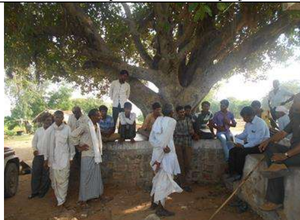
View of people's participation during community consultations at Belada Village.