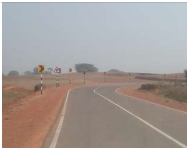
View of constructed Road Marked Paint & Sign Board.