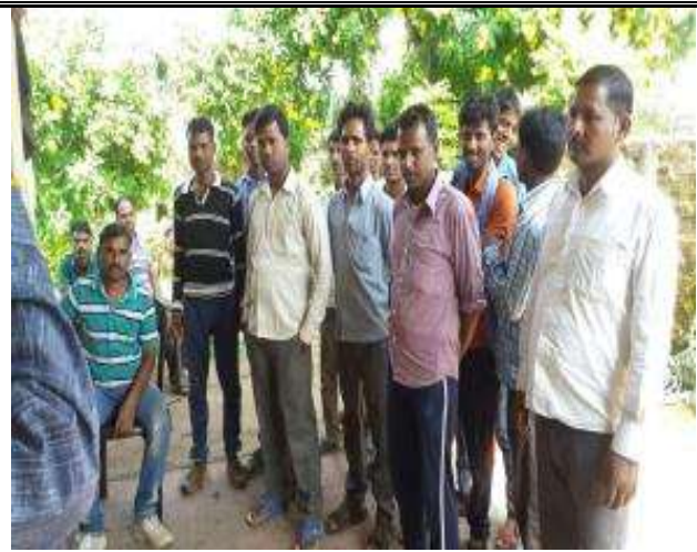
View of AIDS Awareness Program Construction Labor Camp.