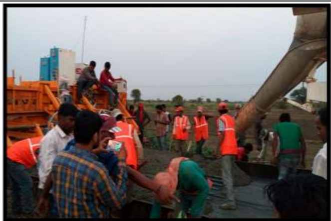
Use of PPE during Civil Construction works