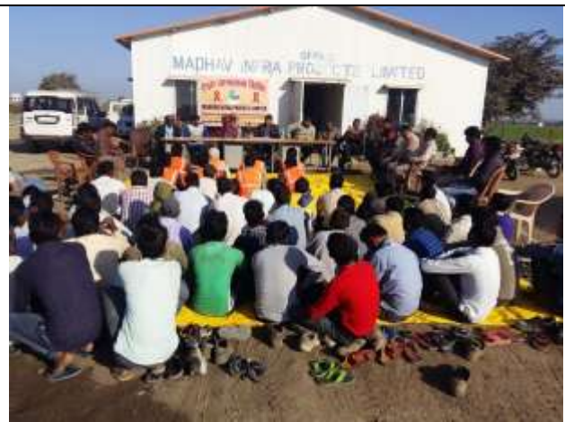
View of AIDS Awareness Program Construction Labor Camp.