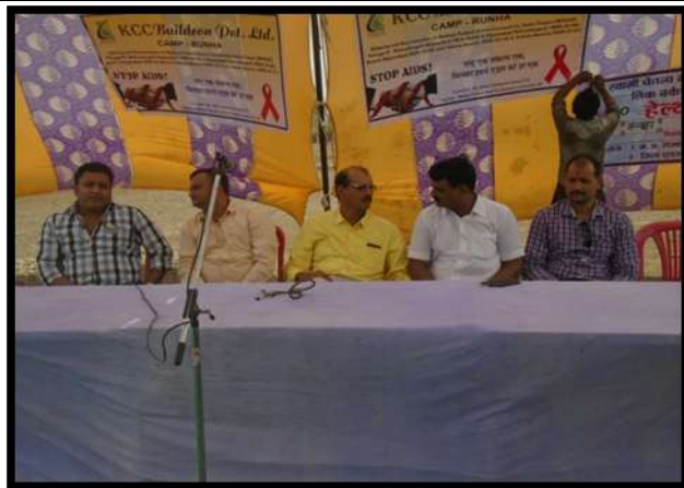
A view of Health camp arranged