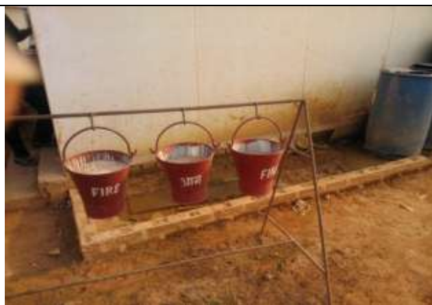
View of Fire Protection Construction Camp