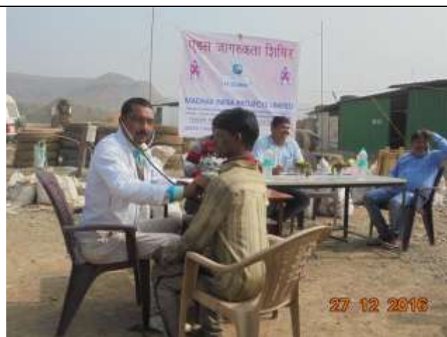
View of AIDS Awareness Program Construction Labor Camp.