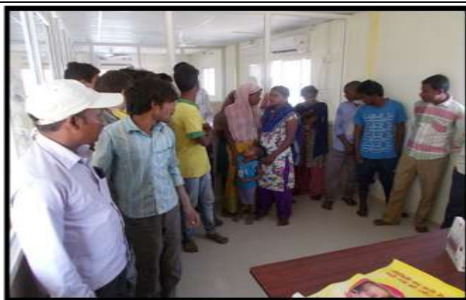
Free Medical / Health Camp arranged at camp site.