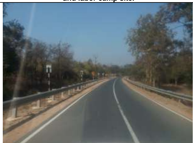
View of constructed Road Marked Paint & Sign Board