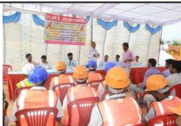
View of AIDS Awareness Program Construction Labor Camp.