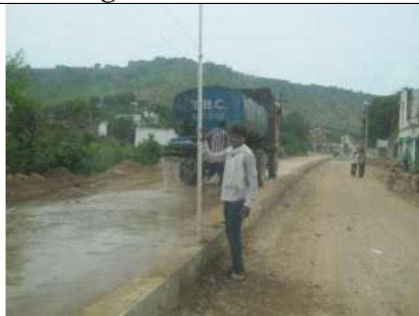
A view of water sprinkling at site for mitigation of dust pollution