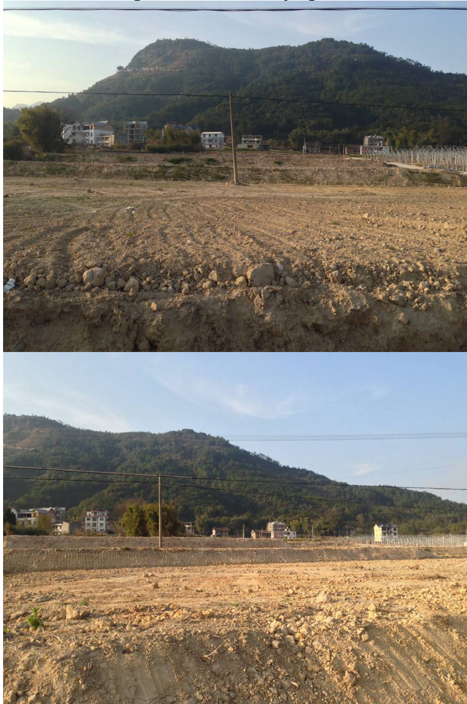
Figure 2 Land for the Dayang Base