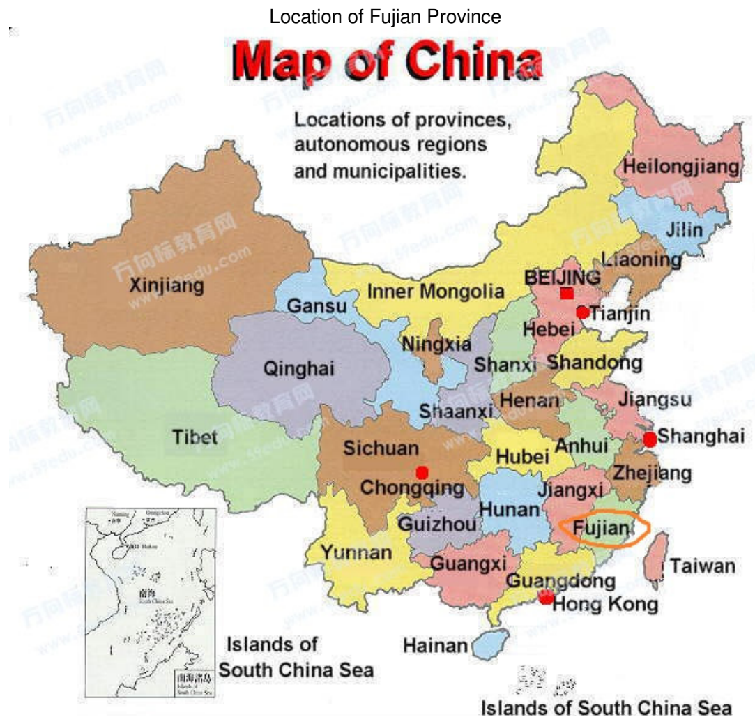
Figure 1-Location of Dayang Farm

1. The project will support Le Gaga in establishing and expanding a series of modern greenhouse operations in Guangdong and Fujian provinces, which have optimal weather and adequate infrastructure for vegetable production, particularly for providing (mainly in winter) off-season vegetables to the entire PRC and some neighboring countries. All the greenhouses are built on leased farmland and operated by PRC companies owned and controlled 100% by Le Gaga. This social safeguard compliance audit report covers the Dayang (大洋) base which locates in Yaoshan Village(瑶山村) of Hanjiang District (涵江区) which is administrated under Putian City (莆田市) of Fujian Province (福建省).