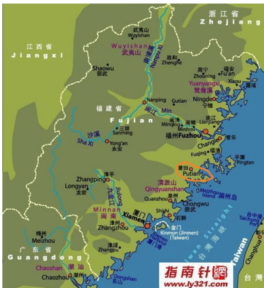
Location of Putian City