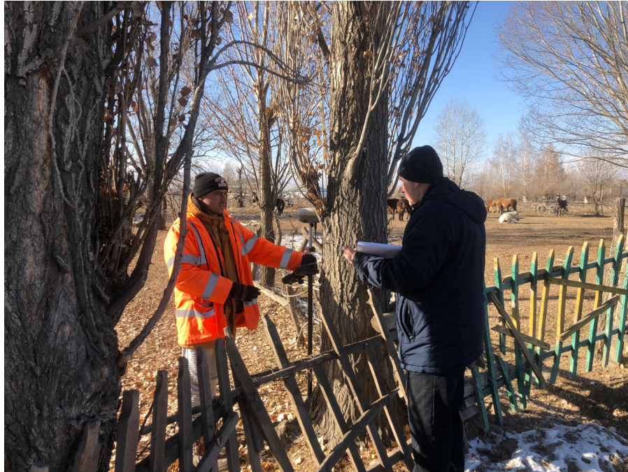
Clarification of objects and AP's, work with engineers, representatives of local authorities and Gosregister