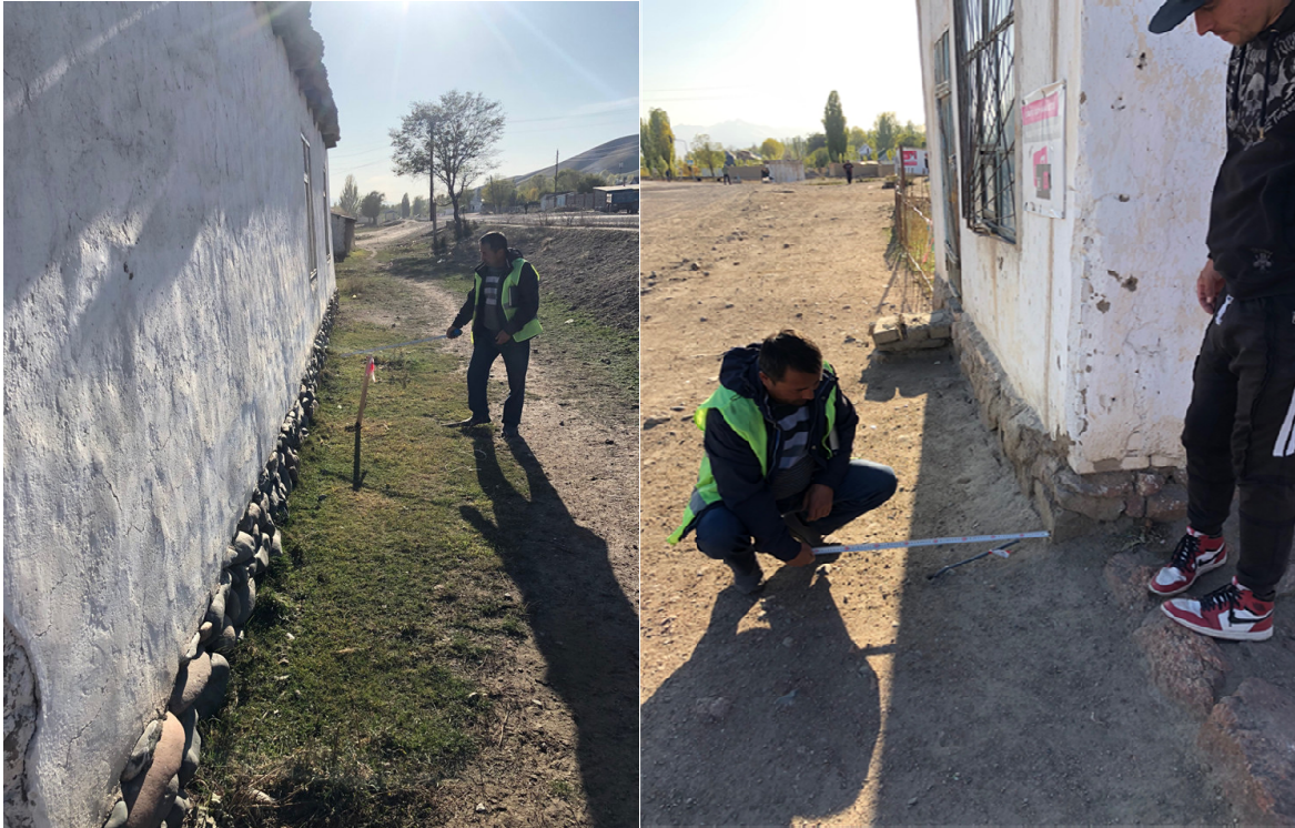
Clarification of objects and AP's, work with engineers, representatives of local authorities and Gosregister