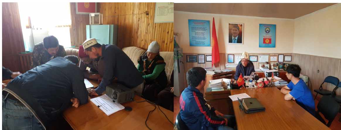
Trainings and meetings with representatives of local authorities

39. IPIG activated and trained Grievance Redress Groups at the local level. IPIG updated the Project Information Brochure and the GRM and ensures that all GRG focal persons are trained and ready. The first round of trainings for members of the established Grievance Redress Groups at the local level, was conducted on 4 July 2019 in each rural district. There were 8 members of the GRGs from Jumgal, Jany-Aryk, Kuiruchuk and Tugol-Sai rural districts. Each session with the question time, lasted for 1-2 hours. The Gentek national resettlement consultant and the IPIG social safeguard specialist, presented jointly the GRM procedure related to the first level grievance redress mechanism. All participants received presentation handouts, the project information brochure with the updated list of GRG members, template forms and necessary information on GRM procedures.