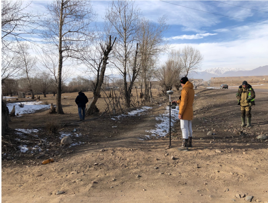
Clarification of objects and AP's, work with engineers, representatives of local authorities and Gosregister