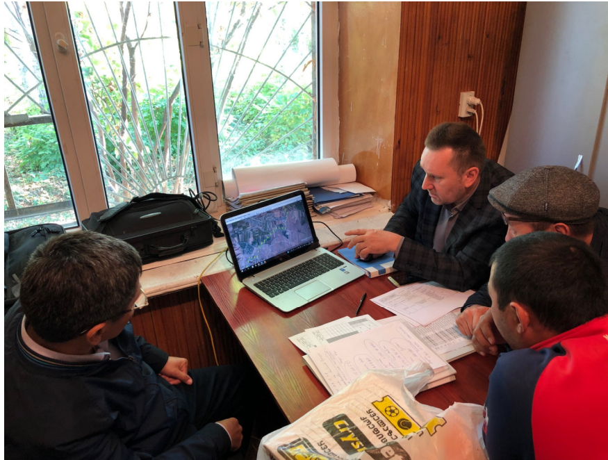
Discussions with representatives of local authorities, Gosregister and engineers