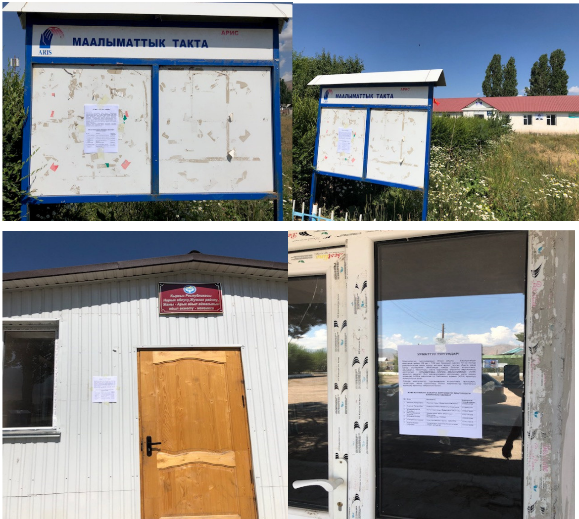
Placement of information brochures with local contact persons