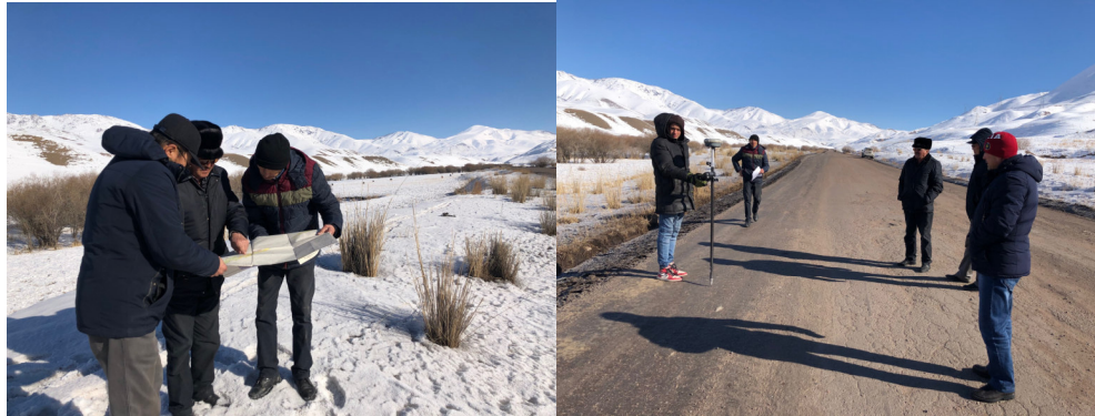
Discussions with representatives of local authorities, Gosregister and engineers