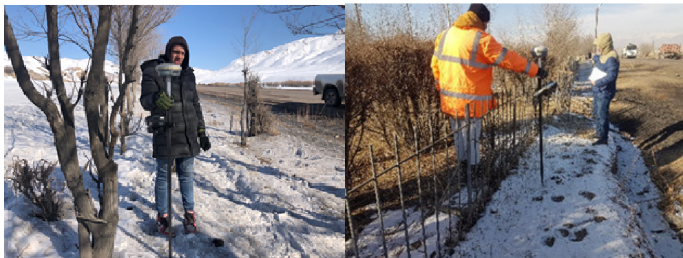
Clarification of objects and AP's, work with engineers, representatives of local authorities and Gosregister