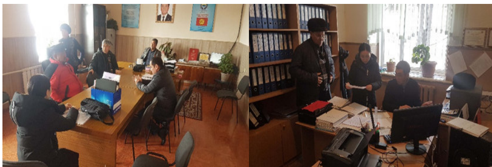
Work with representatives of the Gosregister and local authorities