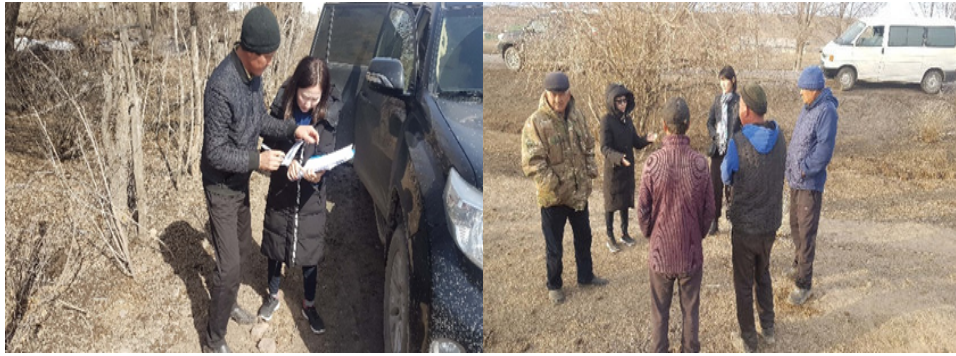
Meetings with APs and members of local communities