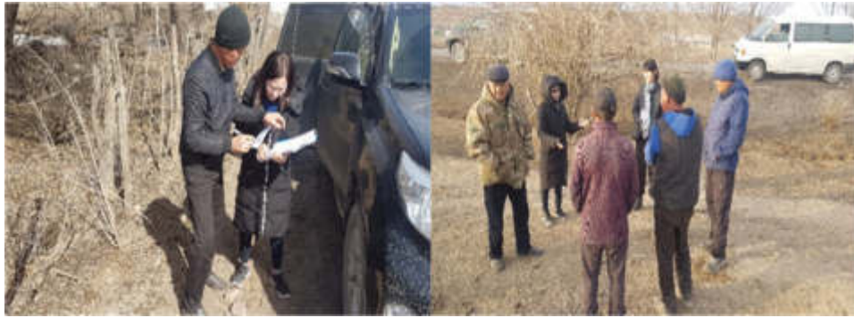
Meetings with APs and members of local communities