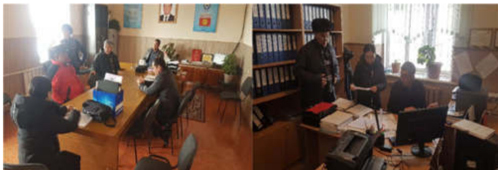
Work with representatives of the Gosregister and local authorities