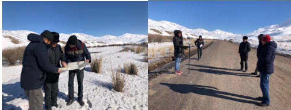
Discussions with representatives of local authorities, Gosregister and engineers