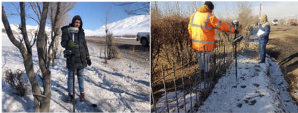
Clarification of objects and AP's, work with engineers, representatives of local authorities and Gosregister