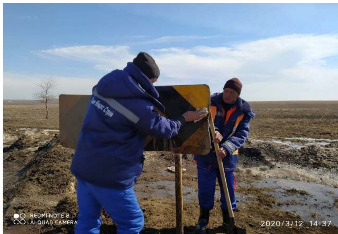
Installation of safety signs on the bypass road Lot 1