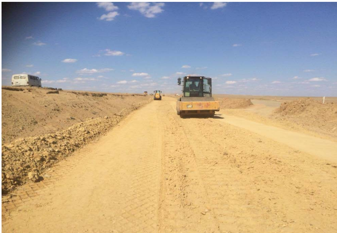
Preparation of the subgrade at CH 423+00