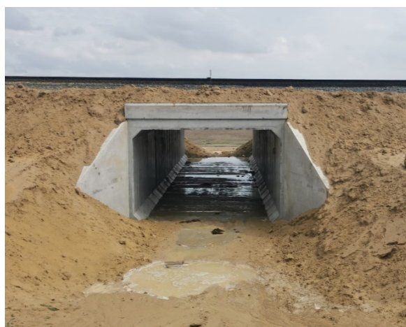
Box culvert on CH 106+40 requested by local residents