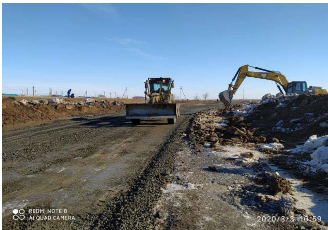
Winter road maintenance Lot 1