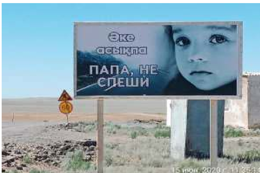
Safety billboard for the attention of drivers. Lot 3.