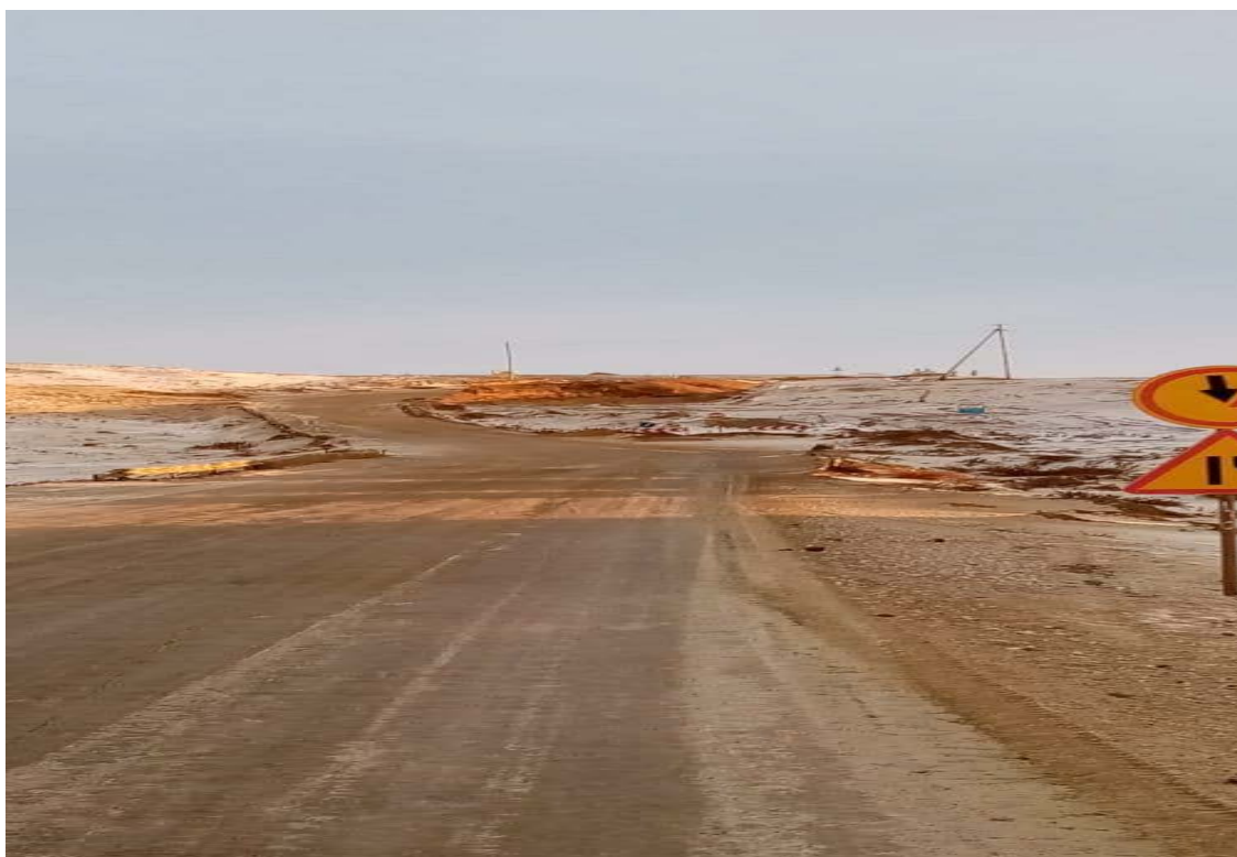
Winter road maintenance Lot 2