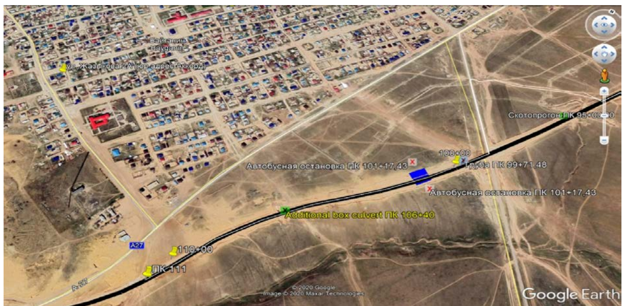
22. During the reporting period, there were no complaints and appeals regarding illegal, unauthorized land acquisition, and no appeals and complaints were received regarding negative impact on local business, roadside trade, since there are no such places on these sites as well as near the bypass road on CH 0+00 – CH 32+33.34. Visits to construction sites in March 2020 and observation of works directly on the site by the CSC specialists did not reveal any negative impacts on social environment.