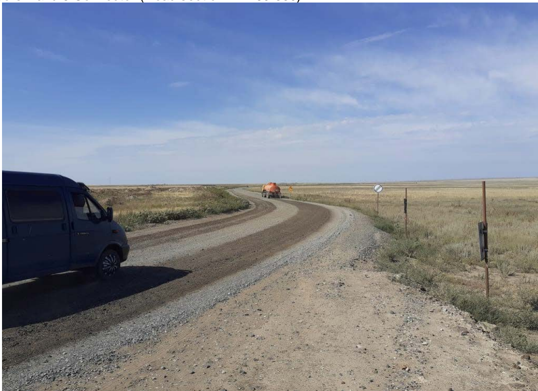
Bypass road on Lot 2 CH 0+00 - CH 32+33,34