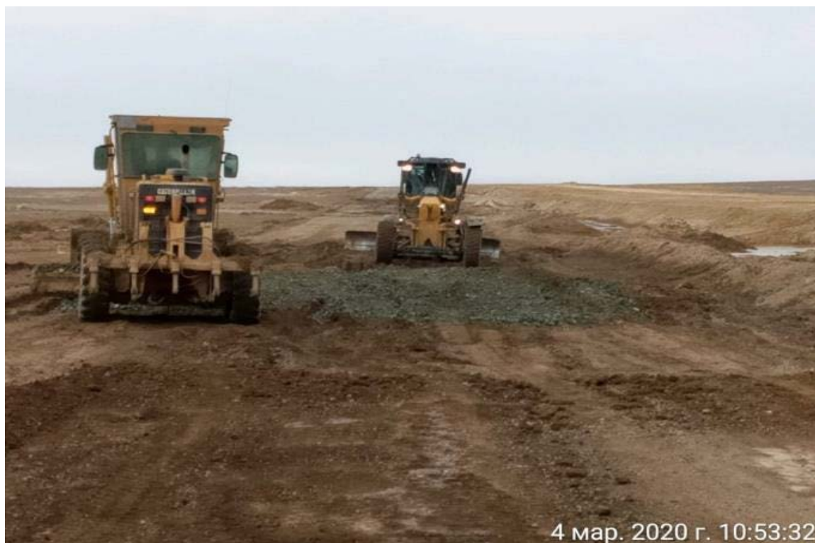
Patching on the bypass road Lot 2