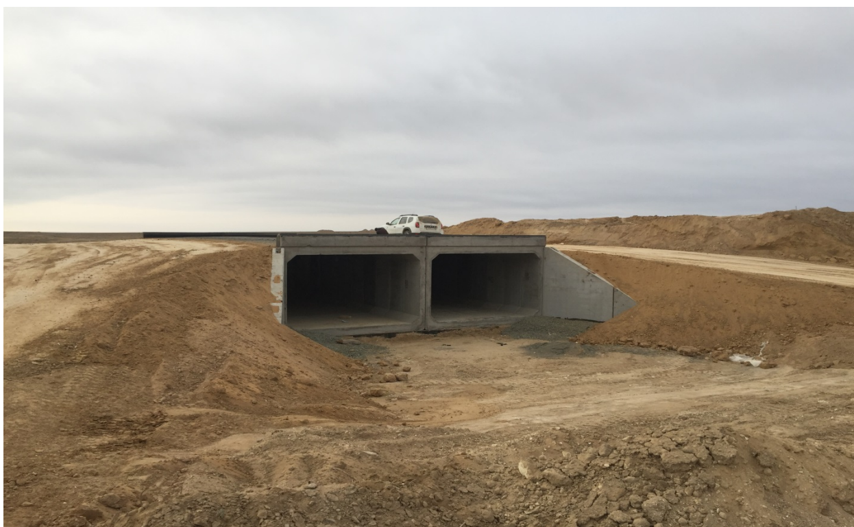
Underpass at Lot 3 km 299