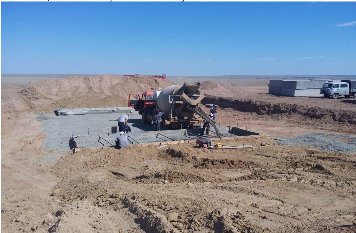
Concrete pouring for underpass CH 182+58