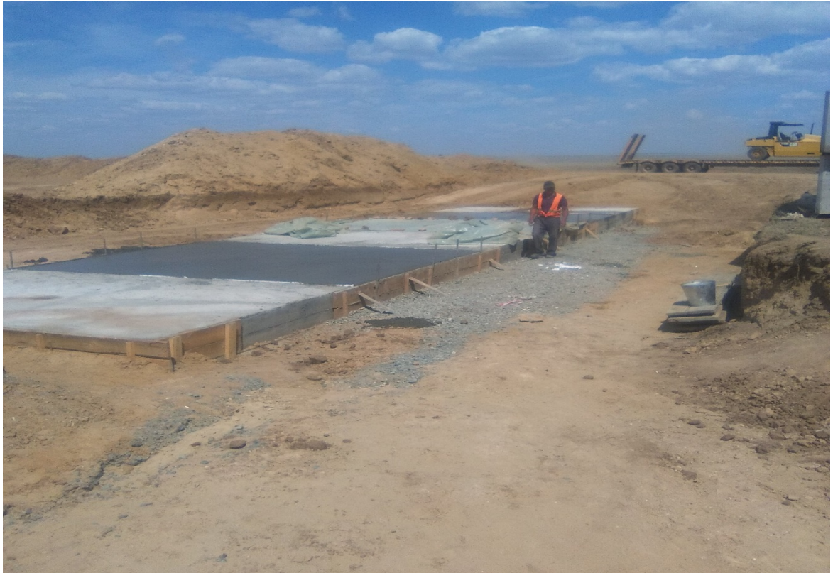
Construction of foundation for underpass CH 162+39,42

Second Semi-Annual Social Safeguards Report 2018. CAREC Corridors 1 and 6 Connector Road (Aktobe–Makat, Section 160-330) Reconstruction Project Lot 2 base camp, Km 239. During inspection of the canteen for the contractor's personnel