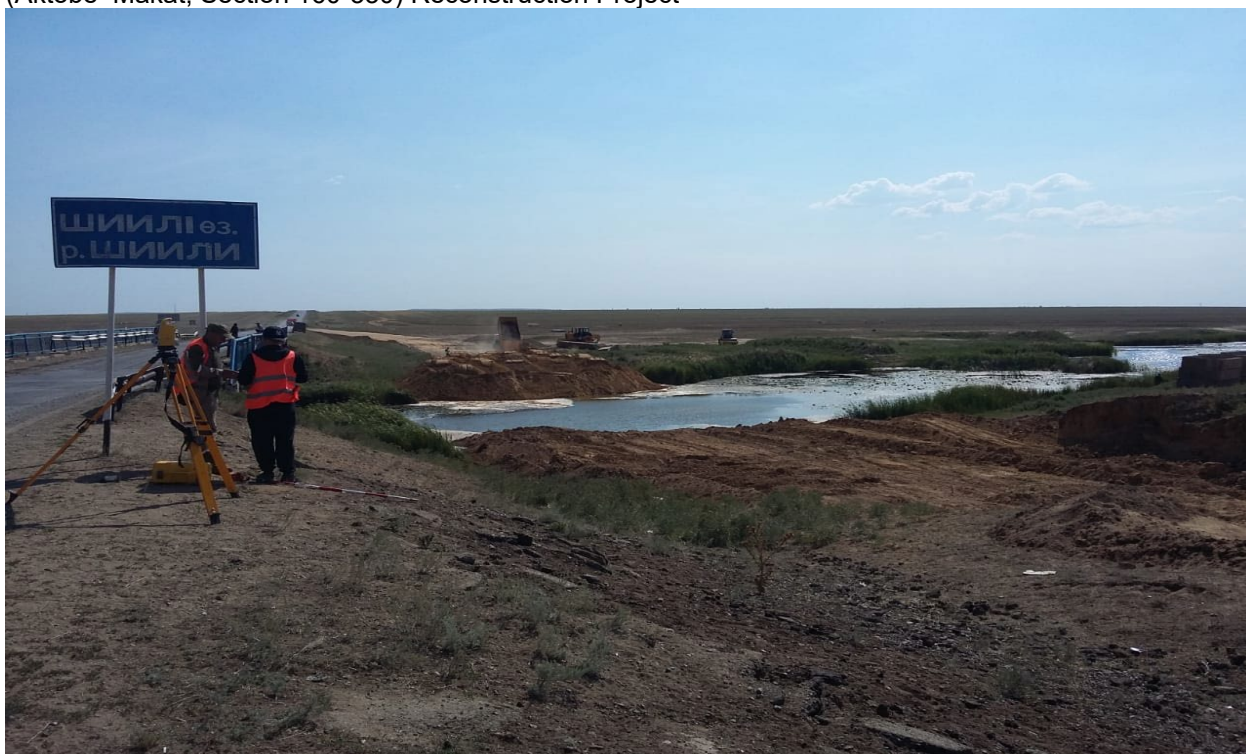
Preparatory work on bridge bypass, km 182+306