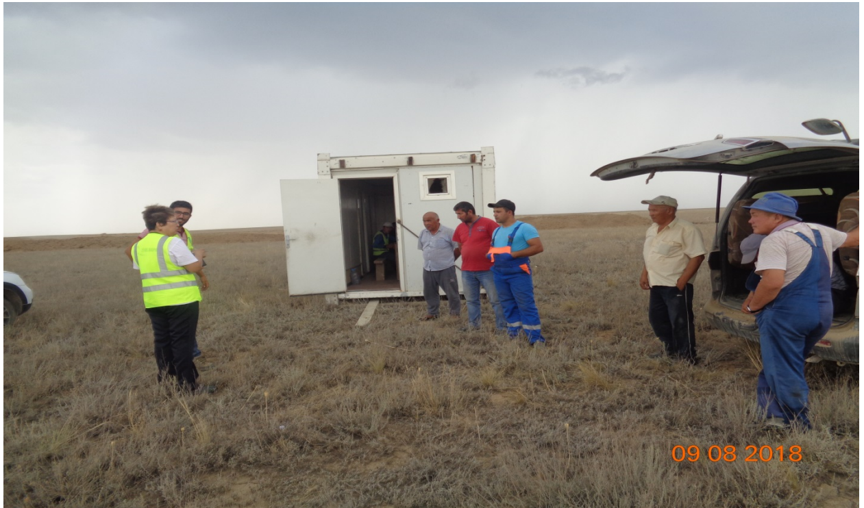
During conversation with workers on site, Lot 3 Km 259. Dining facility.