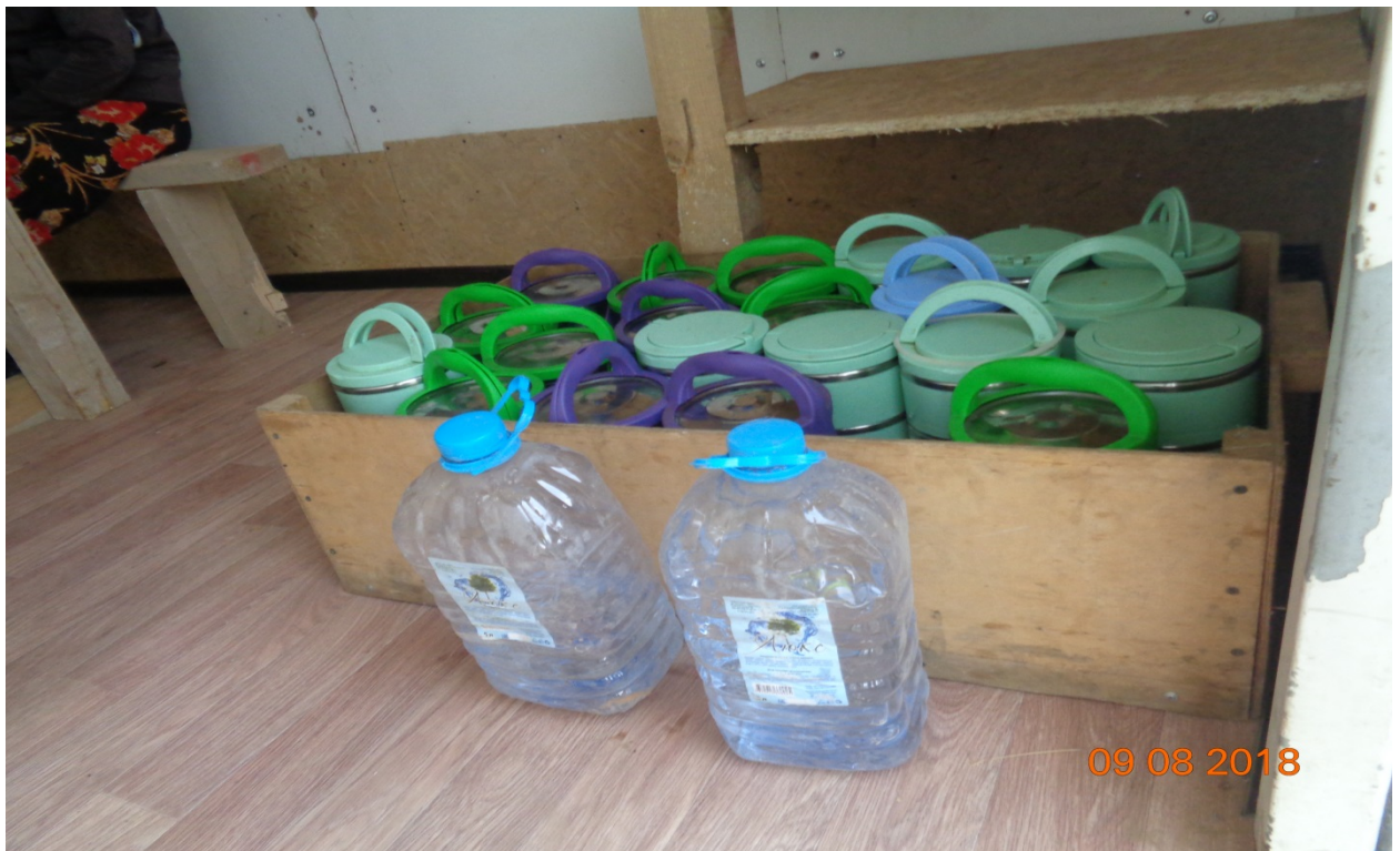
Meals are delivered to remote areas in individual thermoses.