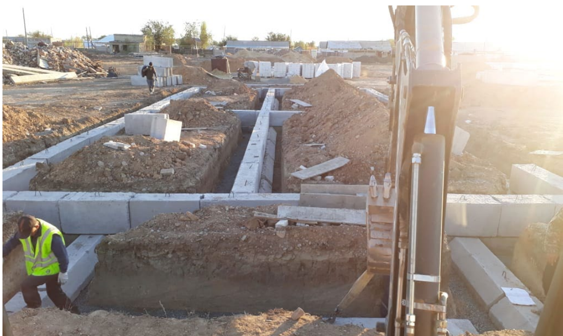
Installation of foundation for RMD administrative building at Lot 1