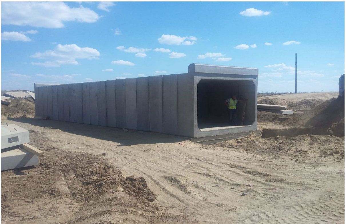
Underpass installation CH 140+29