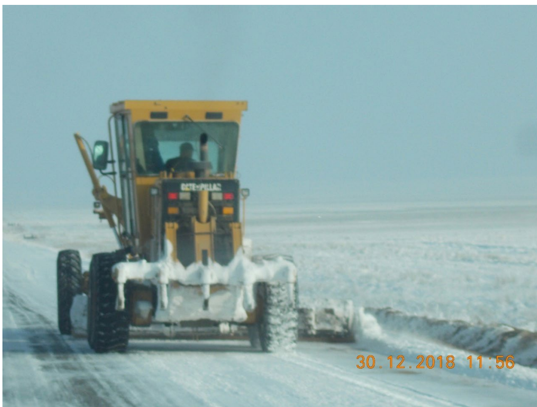
Snow clearance on bypass road Lot 1.