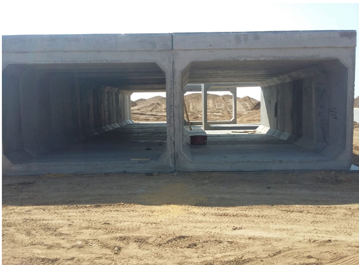
Underpass units installation CH 179+64