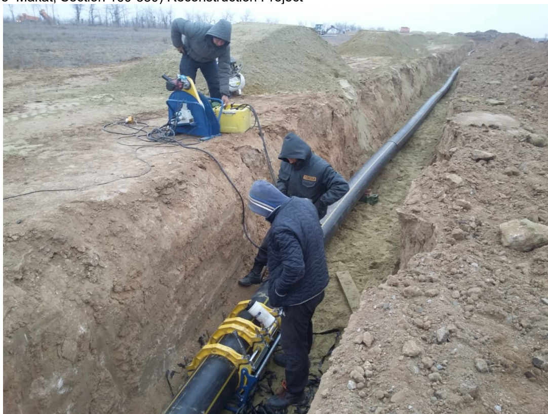
Relocation of gas line Lot 1, km 172+650.