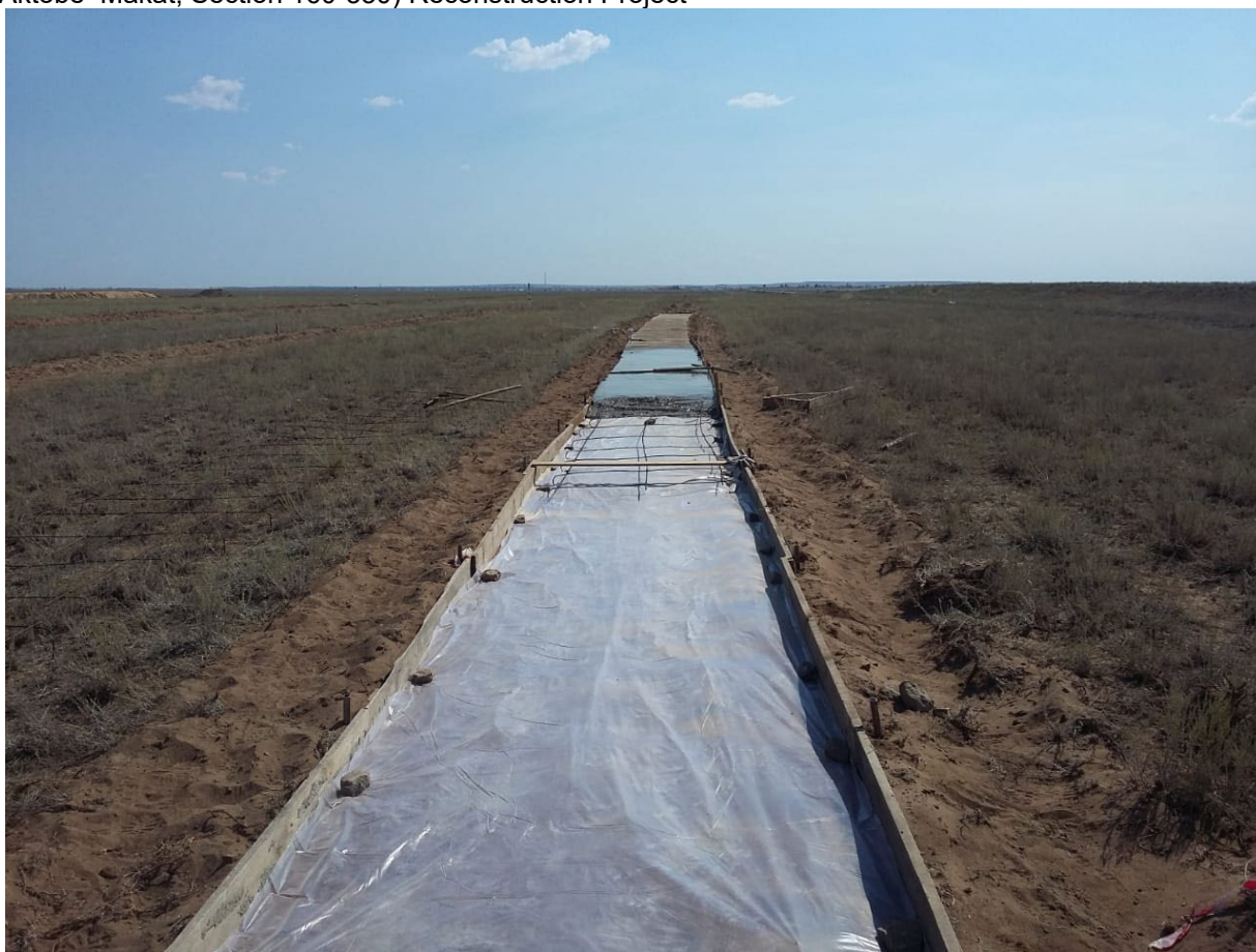
Protection of existing communications Lot 1, Km 180+800