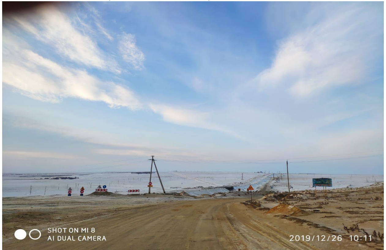
Bypass road Lot 2, Karaulkeldy village