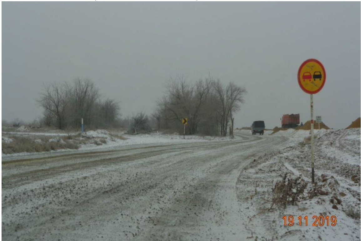
Activities for winter maintenance of the bypass road at PK 608+00