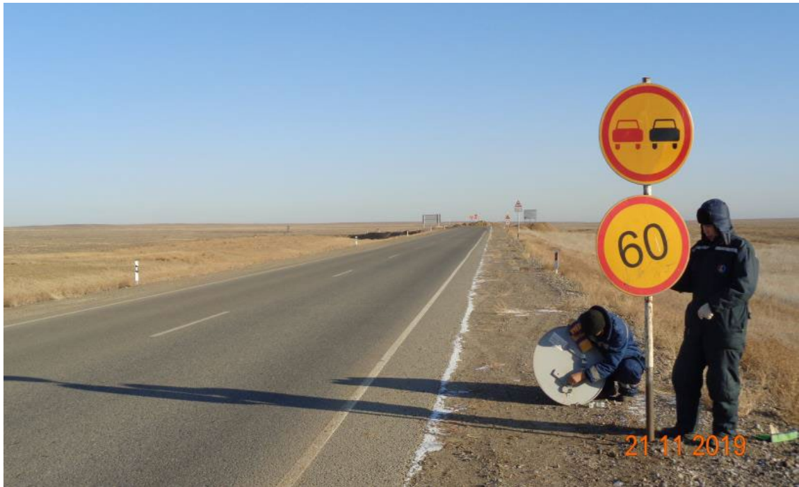
PK 608+00 installation of safety signs