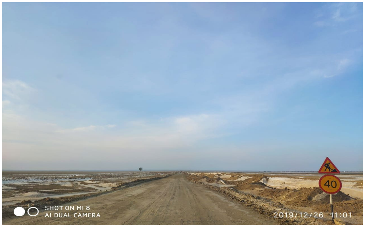
Bypass road Lot 3, Nogaity village