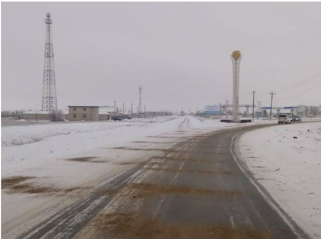
Lot 1 section winter mnaintenance 1, Shubarkuduk. December