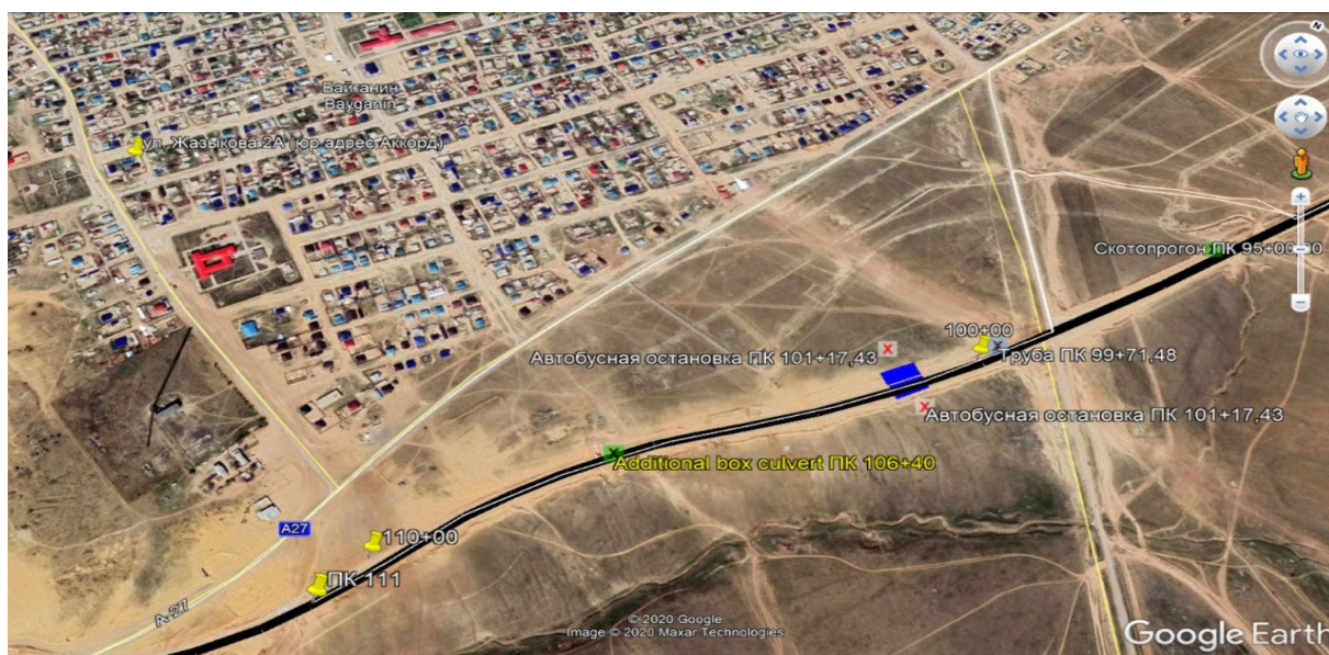
Fig.2. Location of the box culvert on Lot 2.

This box culvert has been built in the strip of the existing permanent land acquisition of the CoR, i.e. the existing strip of permanent land acquisition made it possible to build requested box culvert within its boundaries. In addition, there are no buildings on the designed place for additional box culvert. Below in Figure 2 is a scheme of the box culvert location.