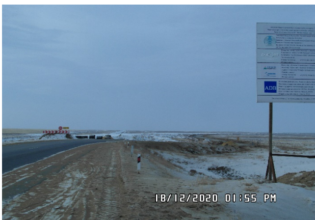
Site passport Lot 2