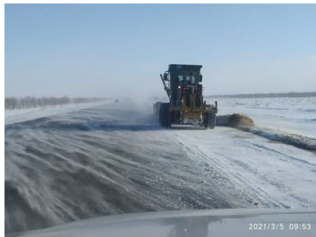
Lot 1. winter maintenance of the road, cleaning of ice body and sanding