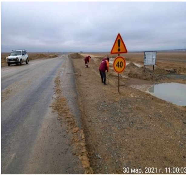
On Lot 3. Installation of speed-limit signs