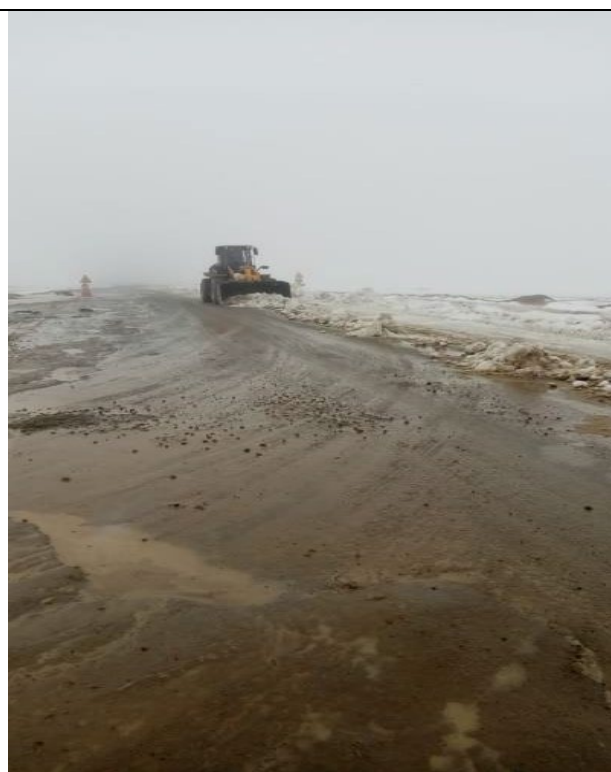
Road maintenance on Lot 2, March 2021