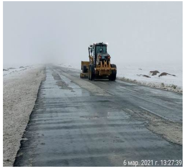
On Lot 6. winter maintenance of the road, cleaning of ice body