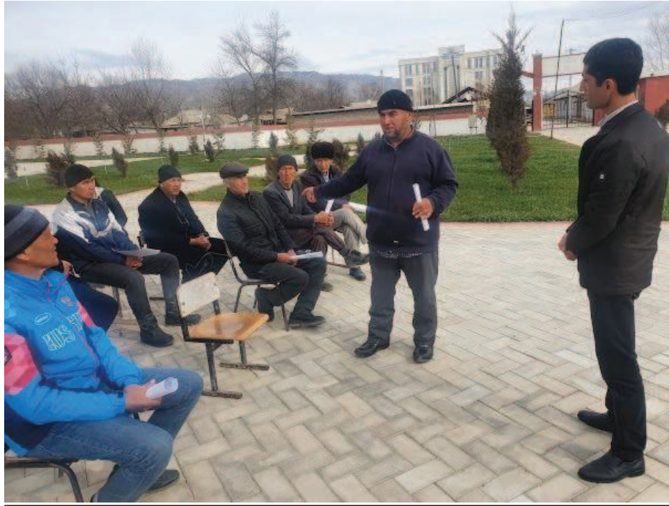
Photo 3. Speech of the Leader of Safobahsh community