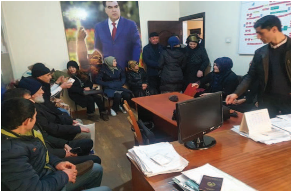
Photo 1. National Social Safeguards Specialist of Kocks Consult sharing project objectives and benefits to the participants

Photos of Public Consultation conducted on February 3, 2023 in Sino (Avicenna) District jointly by PIURR and CSC for the CP-09 (Package 1A and 1B)