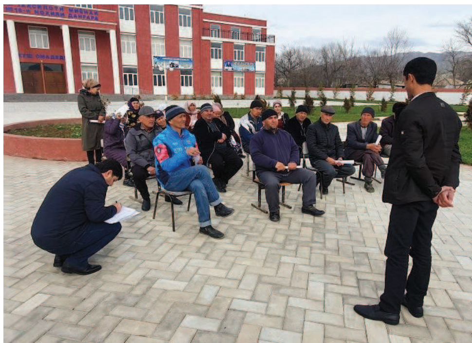
Photo 2. Organizers of public consultation taking notes and recoding people's concerns