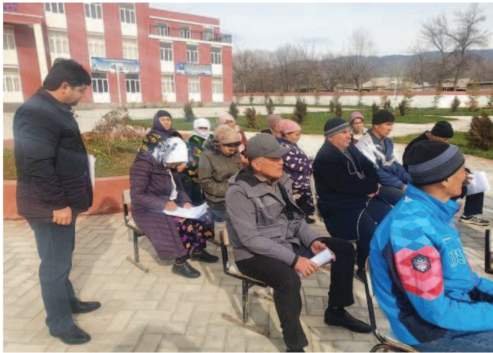
Photo 4. The PIURR representative distributed project handouts and is ready to answer questions of the participants