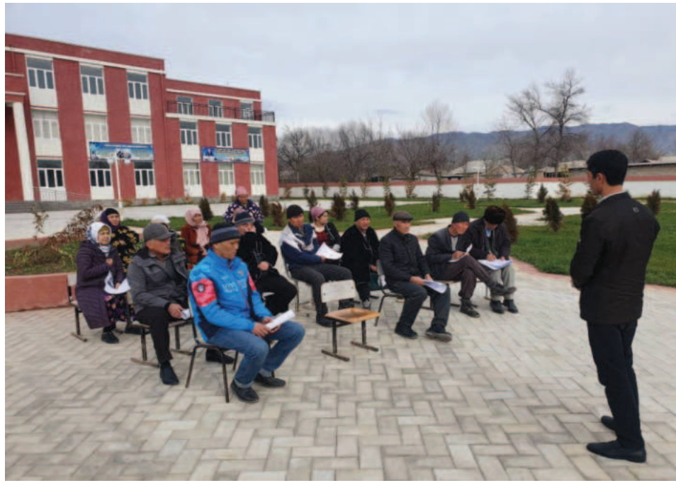
Photo 1. National Safeguards Consultant introducing project objectives and benefits to Safobahsh community

Photos of Public Consultation conducted on February 8, 2023 city of Dangara, Ohsu Jamoat jointly by PIURR and CSC for the CP-10 (Package 2A)