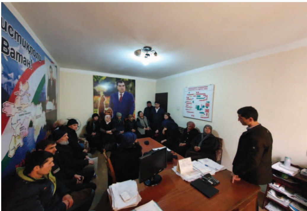
Photo 2. National Social Safeguards Specialist of Kocks Consult is answering the questions raised by the attendees of public consultation