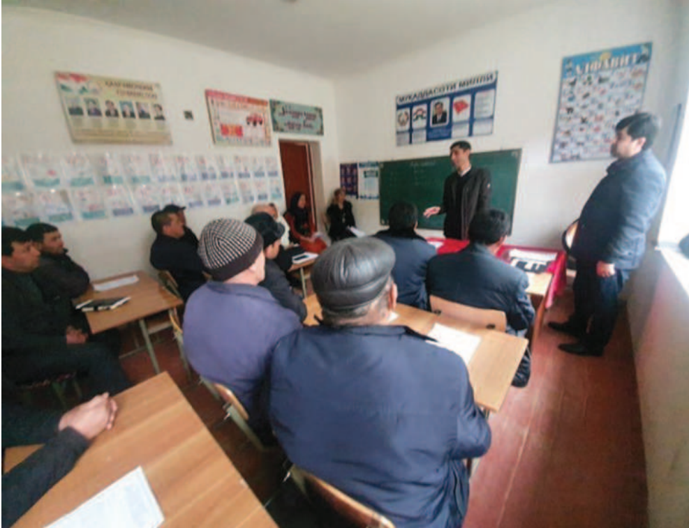
Photo 1. National Safeguards Consultant of Kocks Consult presenting project to the representatives of Kaltachinor Community of Baljuvon District

Photos of Public Consultation conducted on February 8, 2023 in Baljuvon District of Hatlon region jointly by PIURR and CSC for the CP-10 (Package 2B)