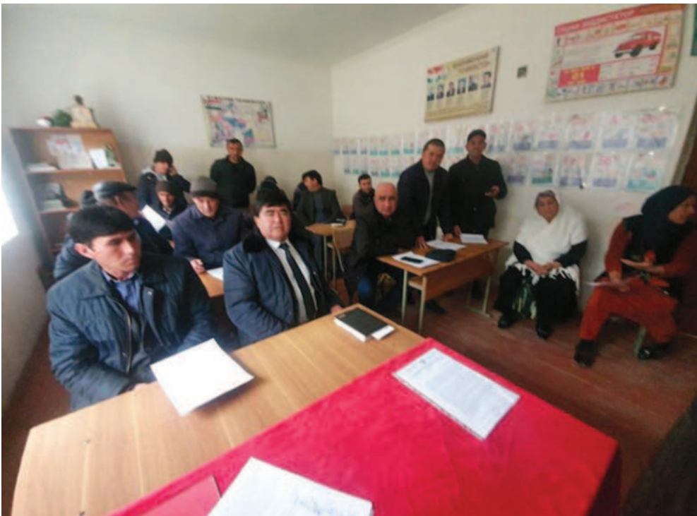
Photo 2. The attendees of public consultation interested in pending project