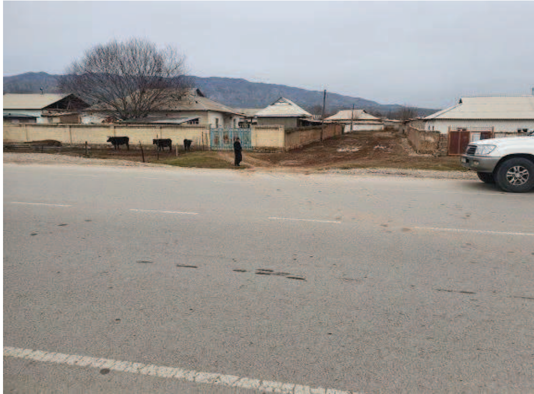
Photo 5. The location for pedestrian crossing requested by the residents of local community