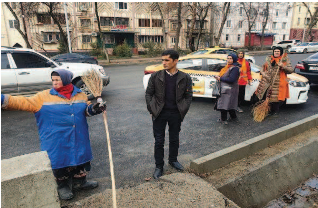
Photo 4. Discussions of the project with the workers of Utility Services at the Bakhoviddinov street