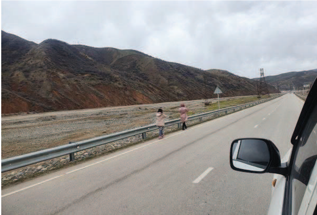
Photo 3. Children walking along the driveway at the road section between Baljuvon and village Kaltachinor. The pedestrian sidewalk requested by the community during consultation.