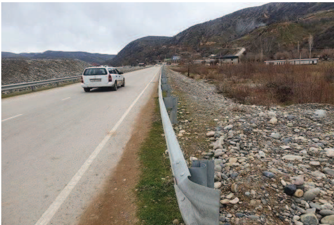
Photo 4. The location for sidewalk requested by the local communities