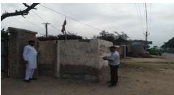
Encroacher – km 54.400 of SH-76 at Thandhurwali (Private Temple)