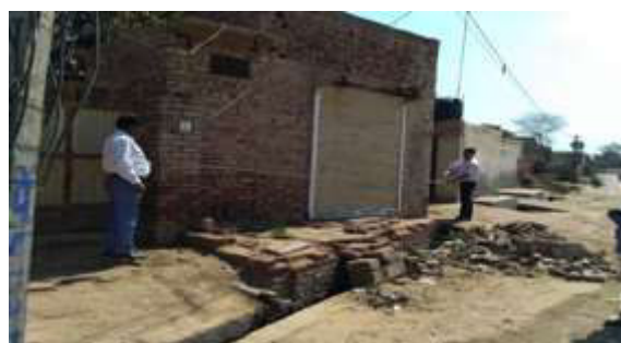
Encroacher – km 59.700 of SH-76 at Tibbi (Residential Cum Commercial Structure)

27. The affected households were categorised based on the severity of impact as significant (loss of 10% and above of the productive asset or structure) and non-significant (loss of less than 10% of the productive asset or structure). The summary of affected households is presented in Appendix 2 .