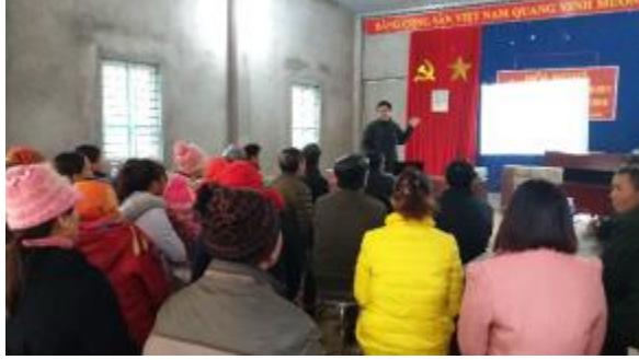
Public consultation in Son Thuy Commune