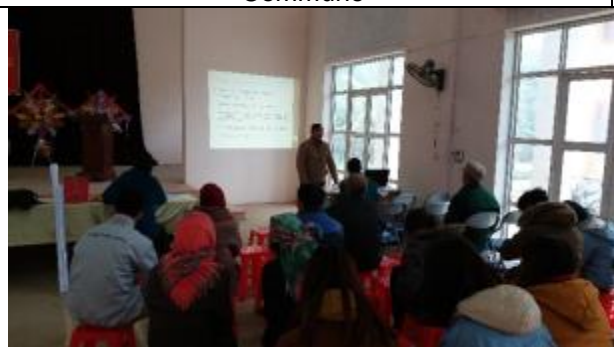
Public consultation in Lang Giang Commune