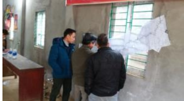
Public consultation in Son Thuy Commune