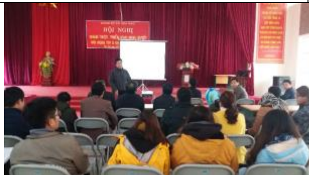
Public consultation in Hoa Mac Commune