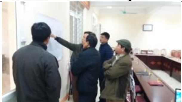
Public consultation in Khanh Yen Town