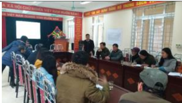
Public consultation in Khanh Yen Town