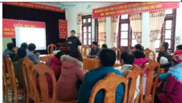
Public consultation in Khanh Yen Thuong Commune