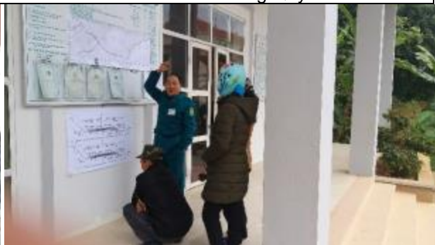
Public consultation in Hoa Mac Commune