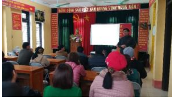
Public consultation in Tan Thuong Commune