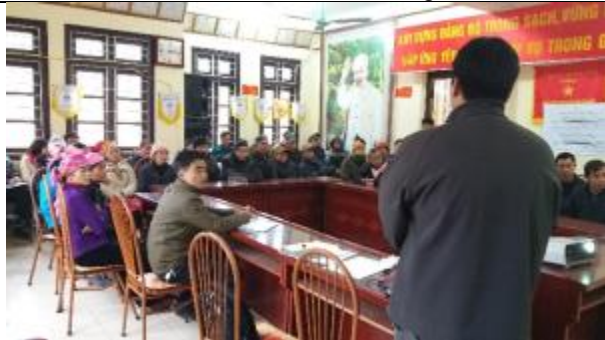
Public consultation in Tham Duong Commune