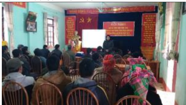
Public consultation in Duong Quy Commune