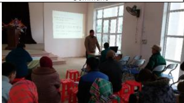
Public consultation in Lang Giang Commune