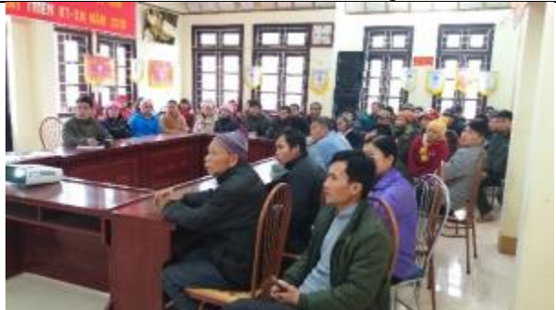
Public consultation in Tham Duong Commune