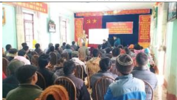
Public consultation in Duong Quy Commune