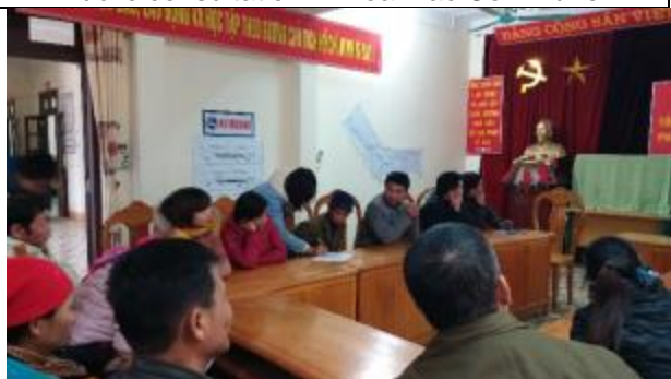
Public consultation in Khanh Yen Thuong Commune