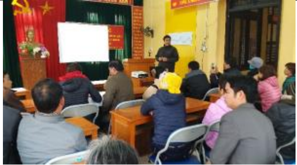
Public consultation in Tan Thuong Commune