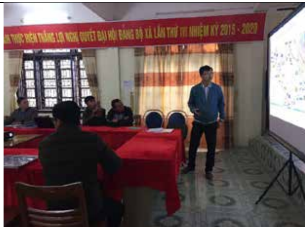
Public consultation in Ban Hon Commune