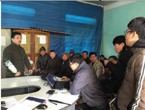
Public consultation in Na Tam Commune