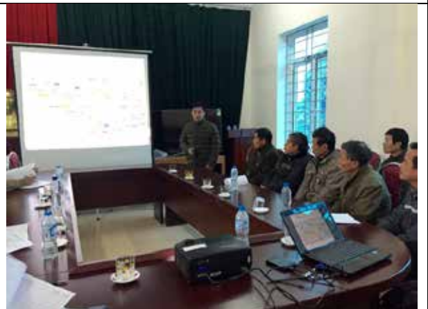
Public consultation in Than Uyen Town