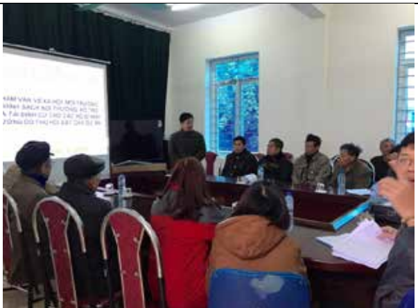
Public consultation in Than Uyen Town