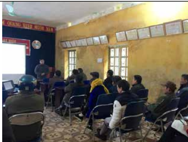
Public consultation in Pac Ta Commune