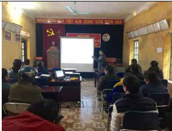
Public consultation in Pac Ta Commune