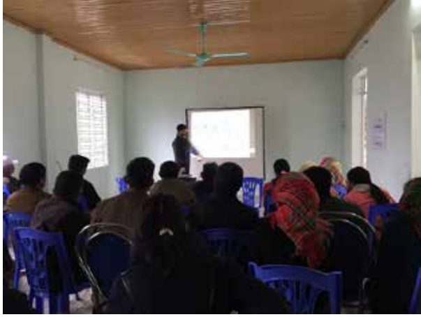
Public consultation in Ban Bo Commune