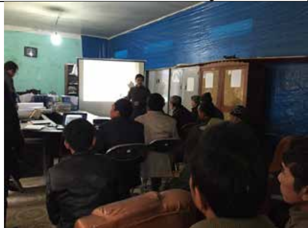
Public consultation in Na Tam Commune