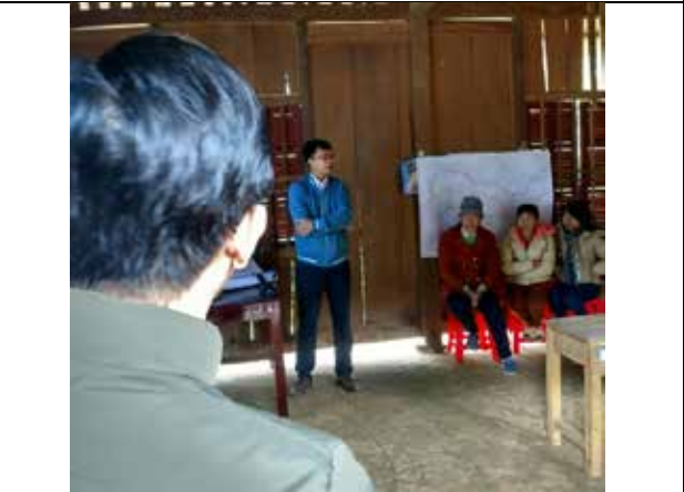
Public consultation in Ban Giang Commune