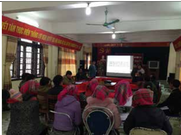
Public consultation in Ban Hon Commune