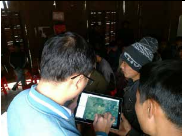
Public consultation in Ban Giang Commune