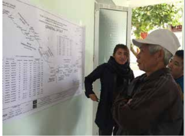
Public consultation in Ban Bo Commune