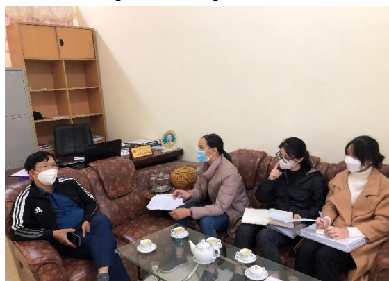
Package CW8- Working with Chairman of Ban Hon CPC