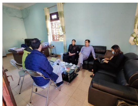
Package CW8- Working with LFDC of Tam Duong dis