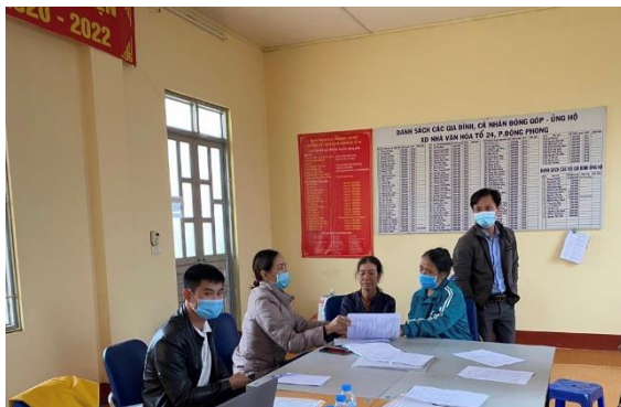
Package 08- Working with AHs in Dong Phong ward