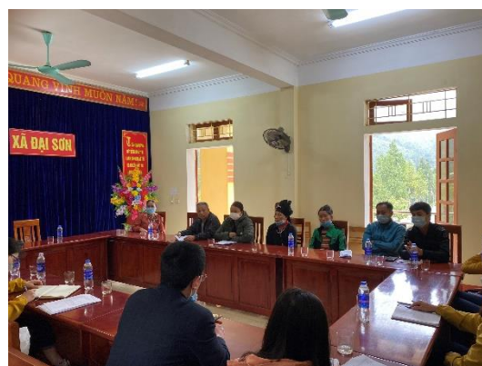
Package CW9- Working with Dai Son commune