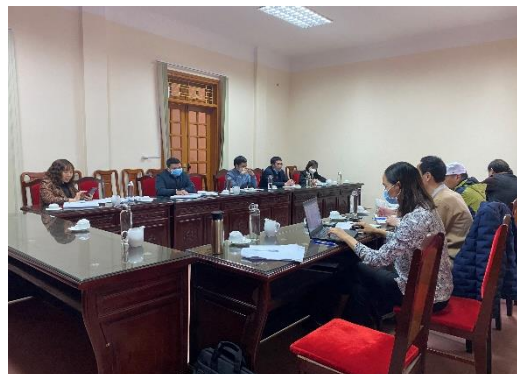
Package 09- Working with LFDC of Van Yen