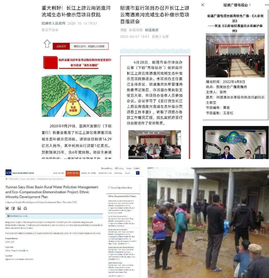
Figure 4-1 Information Disclosure and Publicity During the Project Implementation