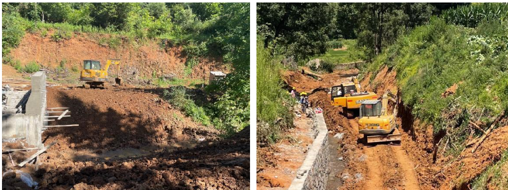
C22 Project construction site