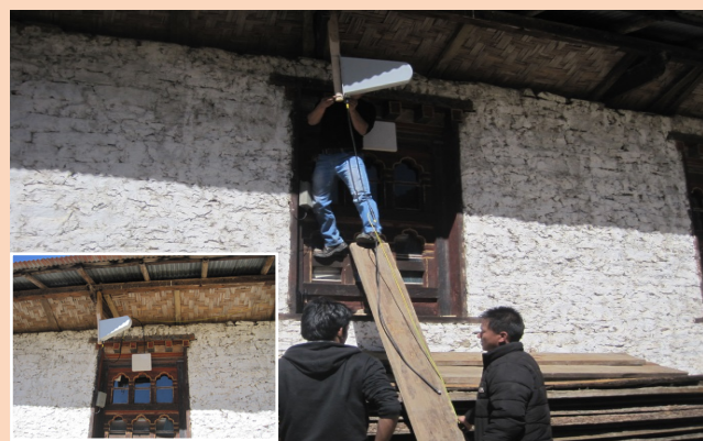
Before and after (inset) the installation of the Television White Space antenna and base station at a health center in Tang, Bhutan.