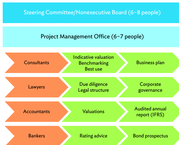
Figure 2: Process for Setting Up a Public Wealth Fund

IFRS = International Financial Reporting Standards.